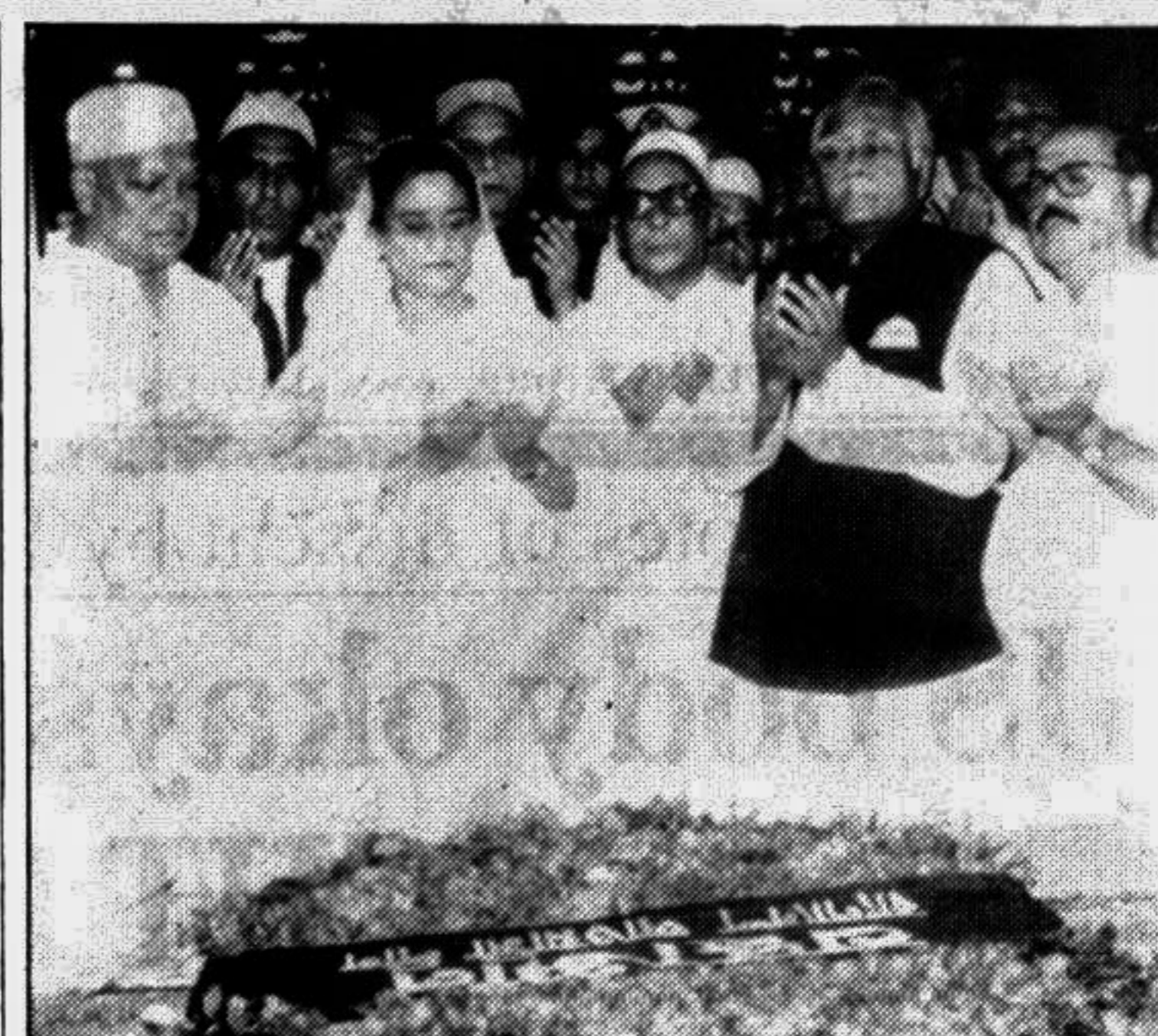
Prime Minister Sheikh Hasina offering munajat after placing wreaths at the mazar of Sher-e-Bangla A K Fazlul Haq yesterday.

In total 26 reports on last year's research activities of 17 research divisions and nine regional stations will be presented for discussion and recommendations.