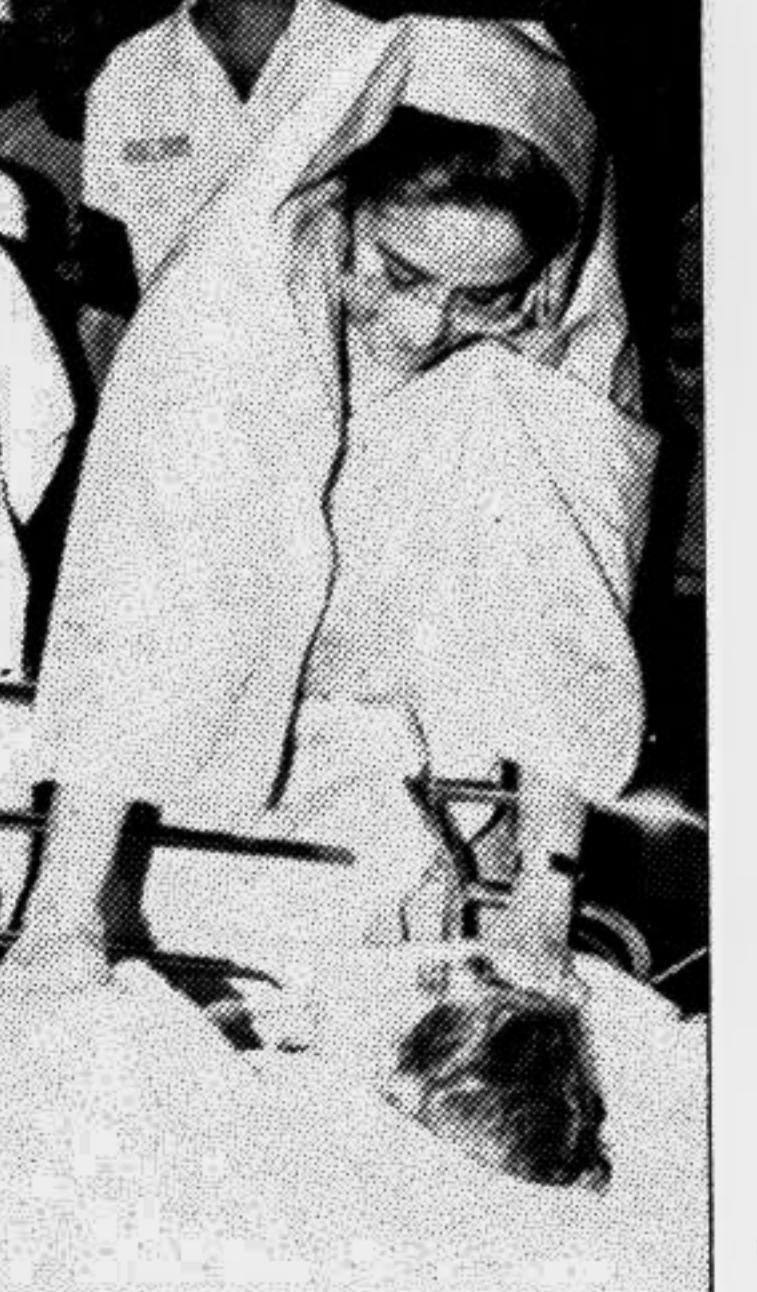
Prime Minister Sheikh Hasina visited ailing poet Begum Sufia Kamal at the Bangabandhu Sheikh Mujib Medical University Hospital in the city yesterday.