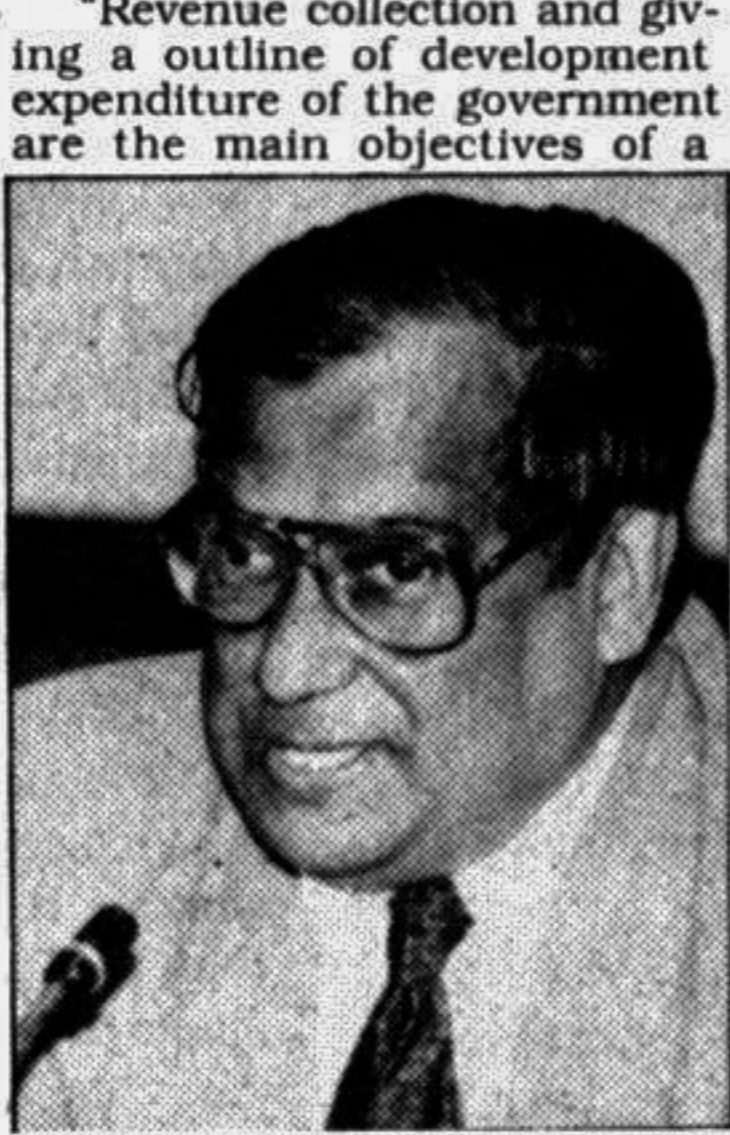
The Finance Secretary ... balancing between good and bad

sizing the government. He said the government should earn the trust of the tax payers who would be clear that no SRO would be issued half way through the year.