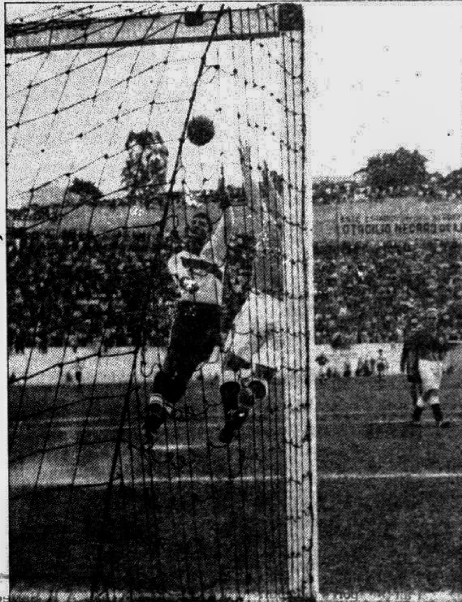
Gaetjens glances the ball past Williams to the horror of all England.

After a barren 45 minutes the Uruguayans buckled two minutes into the second session as Brazil's right-winger Friaca came flying in to crack the ball first time into the net. Brazil fans thought the floodgates would open. But Uruguay had shown signs of aggression and Varela looked menacing. Brazil's instinct was to attack because Uruguay needed two goals to win.