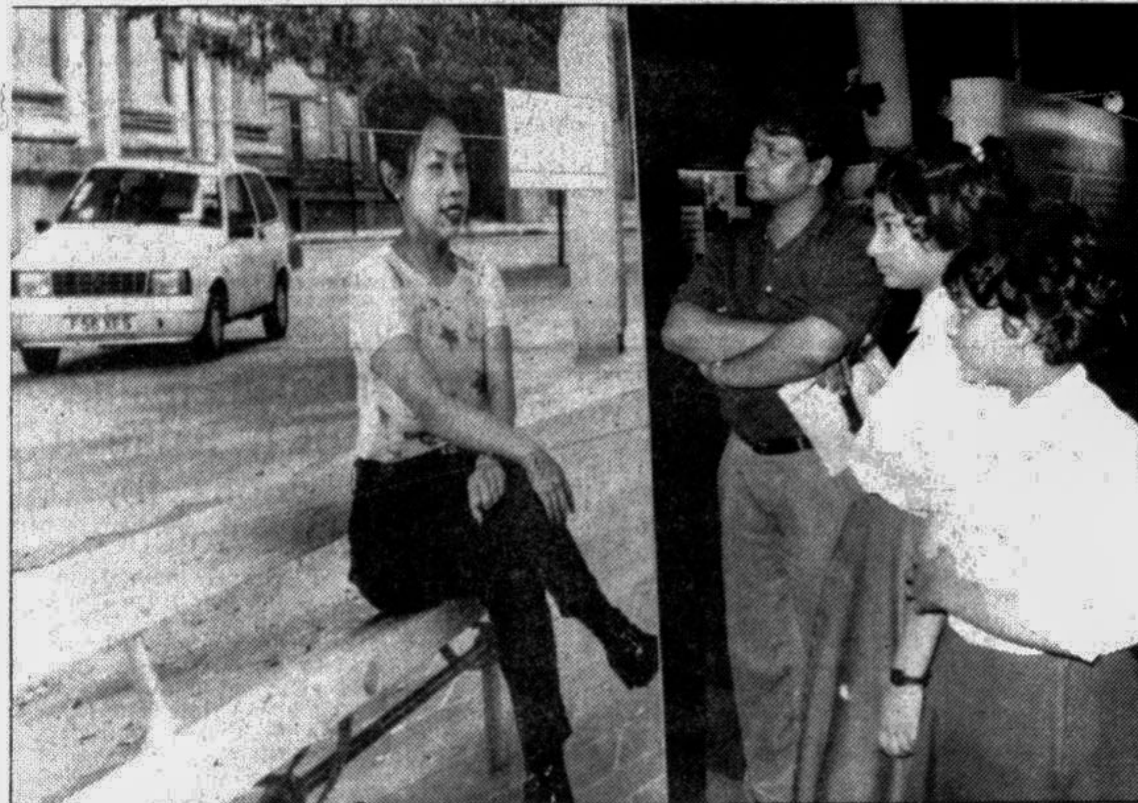
Visitors at an exhibition titled 'Designing Tomorrow' at the British Council in the city on Thursday.

The minister said there is no alternative to training of manpower for implementing the development programmes properly.