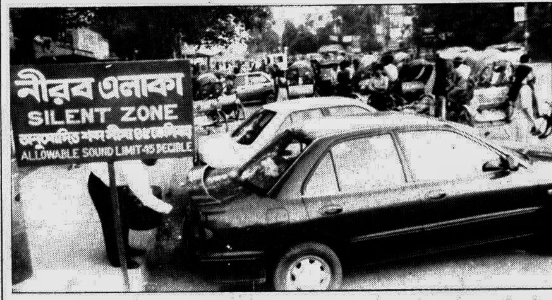
The Department of Environment has put up signboards at several points in the city showing the allowable sound limit of 45 decibel.