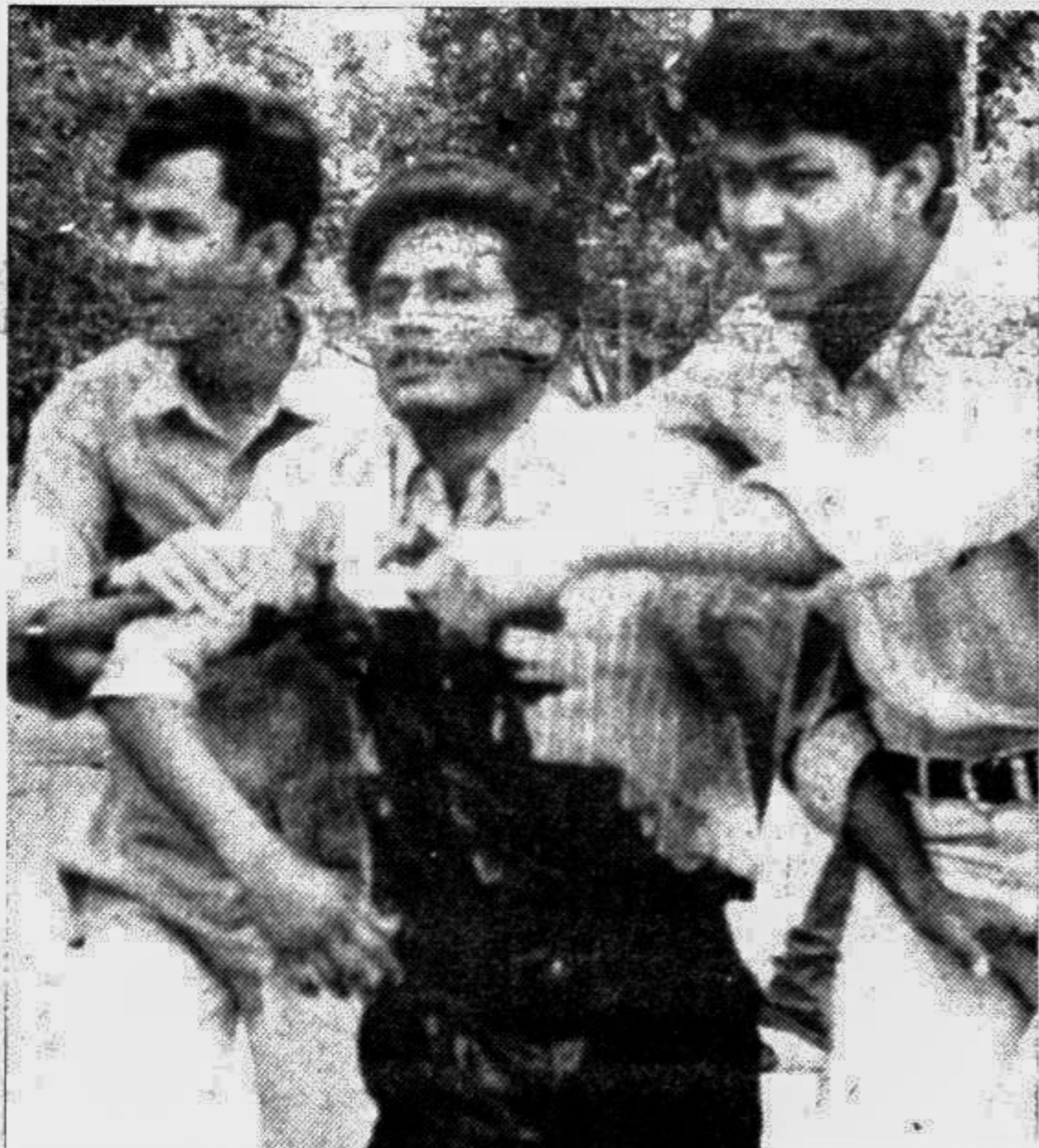
Bullet-hit Partho being rushed to DMCH from the DU campus yesterday. He succumbed to his injuries later.