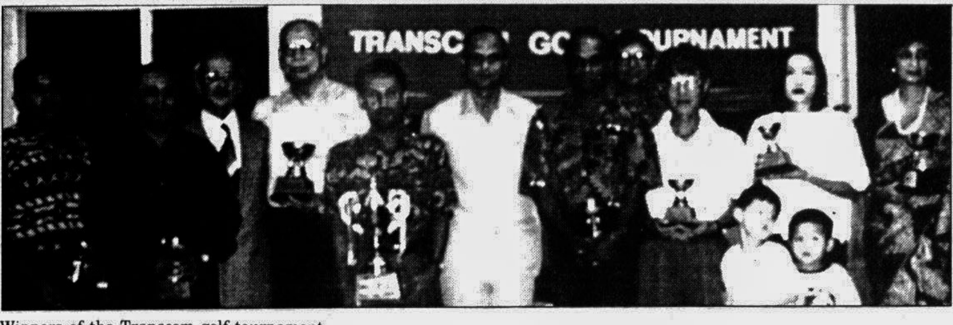
Winners of the Transcom golf tournament.