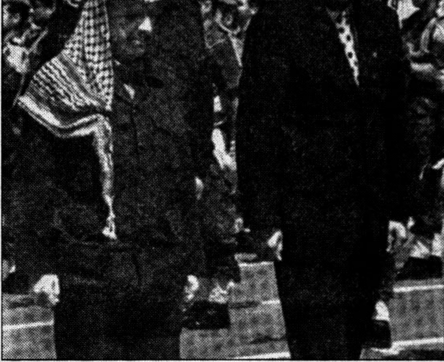
British Prime Minister Tony Blair, escorted by Palestinian leader Yasser Arafat reviews the Palestinian honour guard upon his arrival at Arafat's headquarters in Gaza City Monday.

For the time being, there are no arrangements for direct talks between Arafat and Netanyahu. Instead, US Secretary