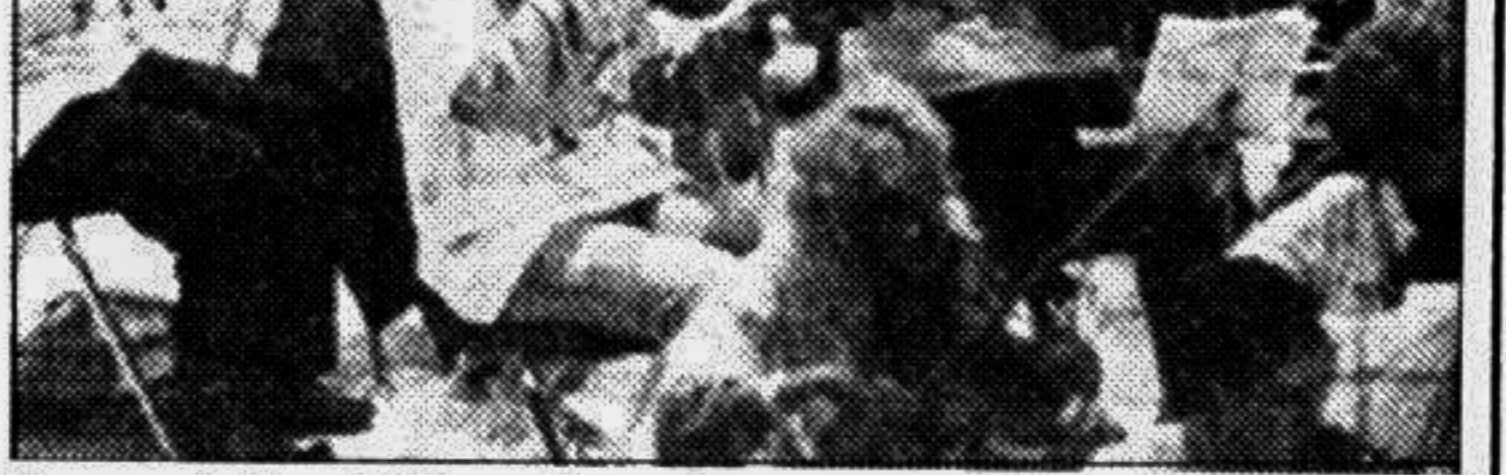
Some of the 1252 string players taking part in setting a record for the world's largest orchestra, in Pittsburgh Sunday. A total of 2049 musicians took part in the event, passing the old record of 2023.