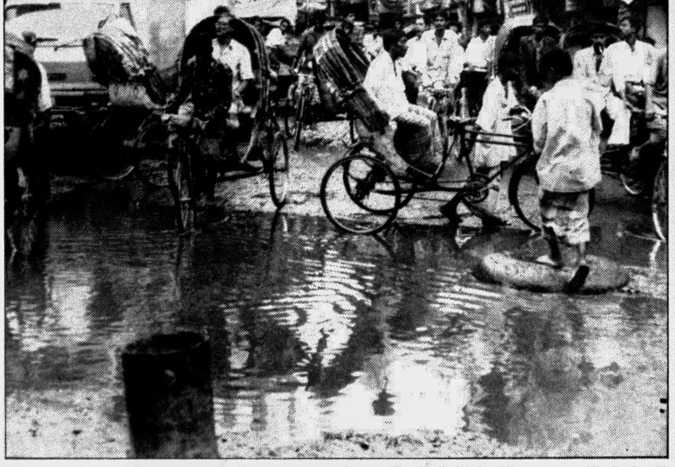
Even light rainfall causes waterlogging in roads in the city's Babu Bazar area for lack of drainage facilities.