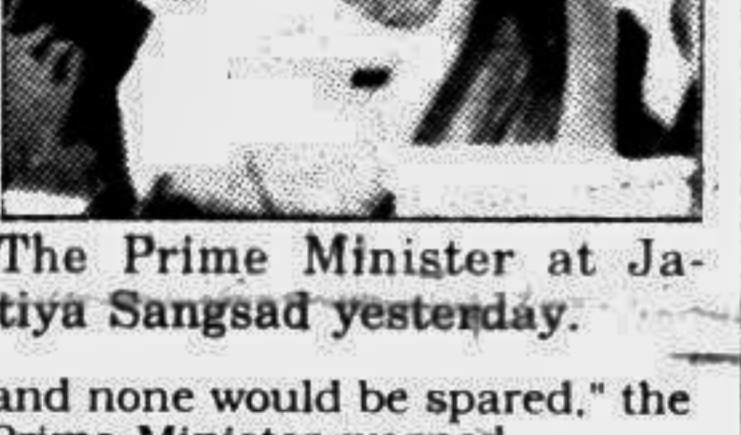
The Prime Minister at Jatiya Sangsad yesterday.

and none would be spared," the Prime Minister warned. Speaking on the difficulties of investigation, Sheikh Hasina informed the House that many documents were burnt and removed when the fall of the BNP government became imminent. To another supplementary, the PM said the authorities were also probing into misuse of the PM's Relief Fund, distributed among the party MPs during the BNP rule. Many cases were filed against the then ruling party MPs in this connection, she added. See Page 12 Col 8