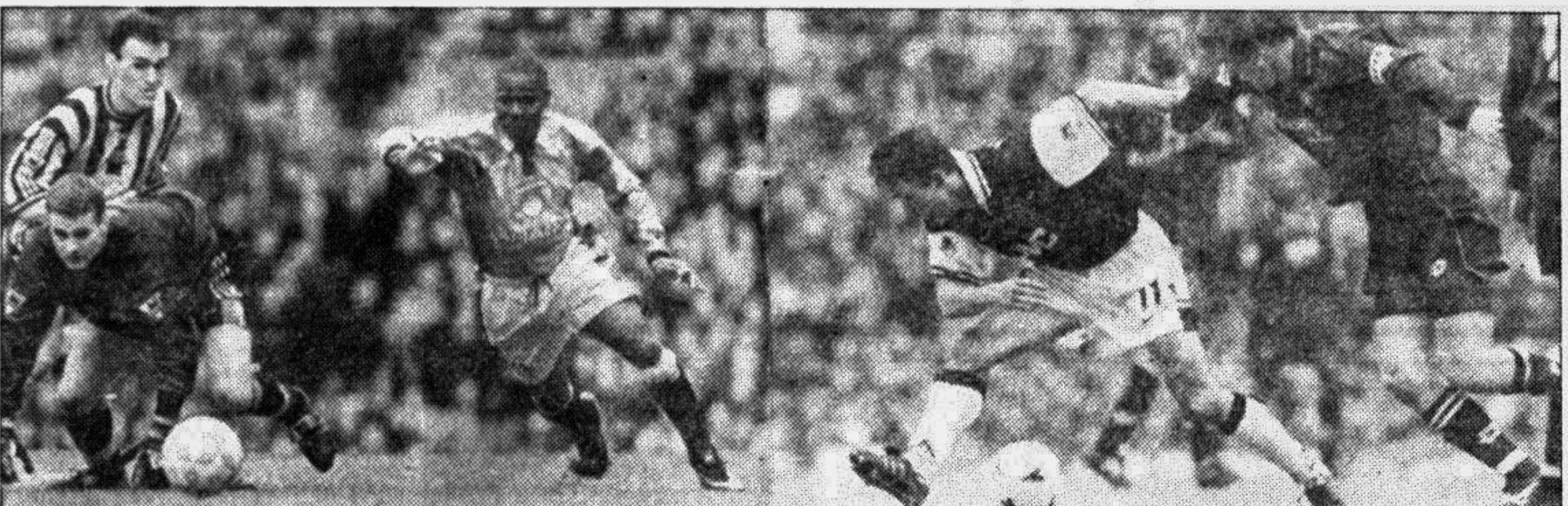
Action from the top of the table clashes of the English Premier league on April 18 — (L) Manchester United's Andy Cole desperate to get to the ball before Newcastle United's custodian Shay Given could scramble to it at Old Trafford during their 1-1 tie while (R) Arsenal's Dutch winger Marc Overmars (No 11) tries to outfox a Wimbledon defender in the Gunners' 5-0 drubbing of the minnows at Highbury.

Bottom club Crystal Palace, almost certain to be relegated, won their first home game of the season 3-1 against Derby.