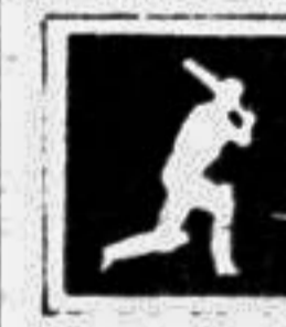
LONDON, Apr 18: Brian Lara returned to the scene of his historic 501-run innings against

Durham on Friday on the first day of the English county season — but was dismissed for a duck after just eight balls, reports Reuters.