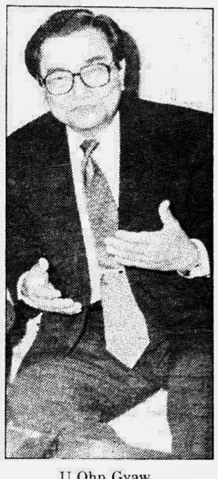
U Ohn Gyaw

By Staff Correspondent Negotiations for resumption of repatriation of the remaining 21,000 Rohingya refugees in Bangladesh will start soon through diplomatic channel and Myanmar will reopen reception centres at its border to take back its nationals. This was said at a joint press conference addressed by visiting Foreign Minister of Myanmar U Ohn Gyaw and his Bangladesh counterpart Abdus Samad Azad at Zia International Airport in the city yesterday. The press conference was held prior to the departure of Gyaw at the end his three-day official visit to Bangladesh. Official talks between the foreign ministers of the two countries held in Dhaka on Friday, however, could not set any date for resumption of the long-stalled repatriation process. Gyaw told newsmen that his country would take necessary steps with regard to 7,000 cases already cleared by it and would apply the same principles in giving clearances to another 9,000 cases. Regarding 252 Myanmar nationals awaiting repatriation after completion of their terms in Bangladesh-jail, Gyaw said the Myanmar Embassy in Dhaka would interview them and take appropriate action in due course. He brushed aside any fresh influx. Abdus Samad Azad said that after necessary clearance from See Page 12 Col 4