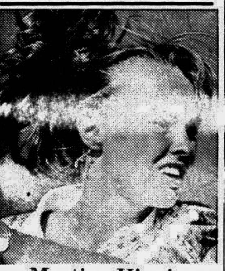
Martina Hingis (World No 1 tennis player) I was pretty thrilled to come here and win the whole thing. After winning the Evet Cup