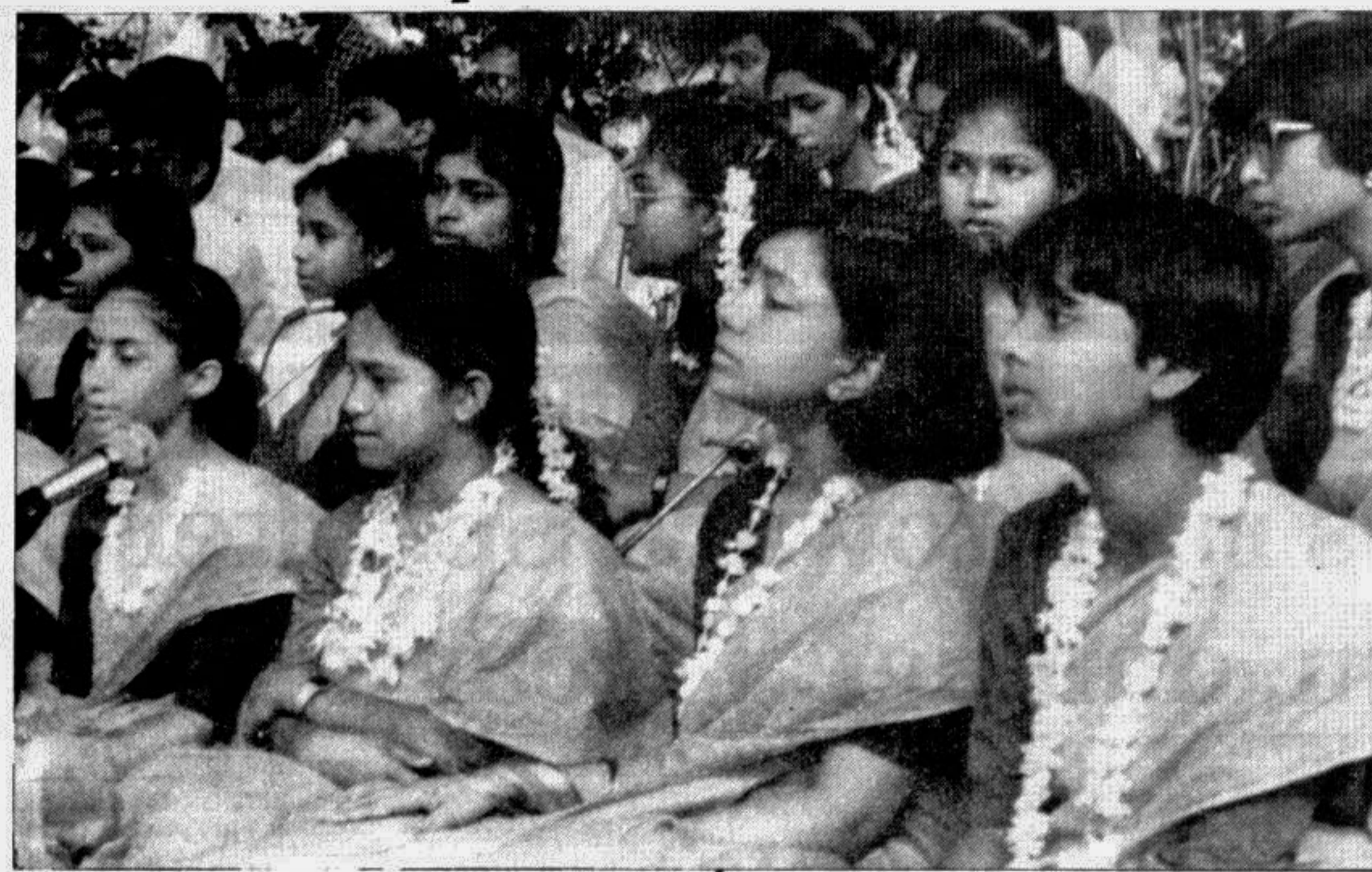
Artistes of Chhayanaut rendering songs welcoming Pahela Baishakh at Ramna Botomul in the city Tuesday.