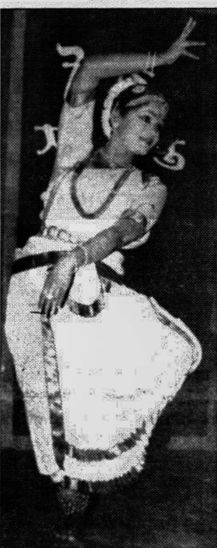
Sammilita Sangskritik Jote organised a cultural programme at the Fine Arts Institute in the city yesterday to mark the Chaitra Sangkranti — the last day of the Bengali year.