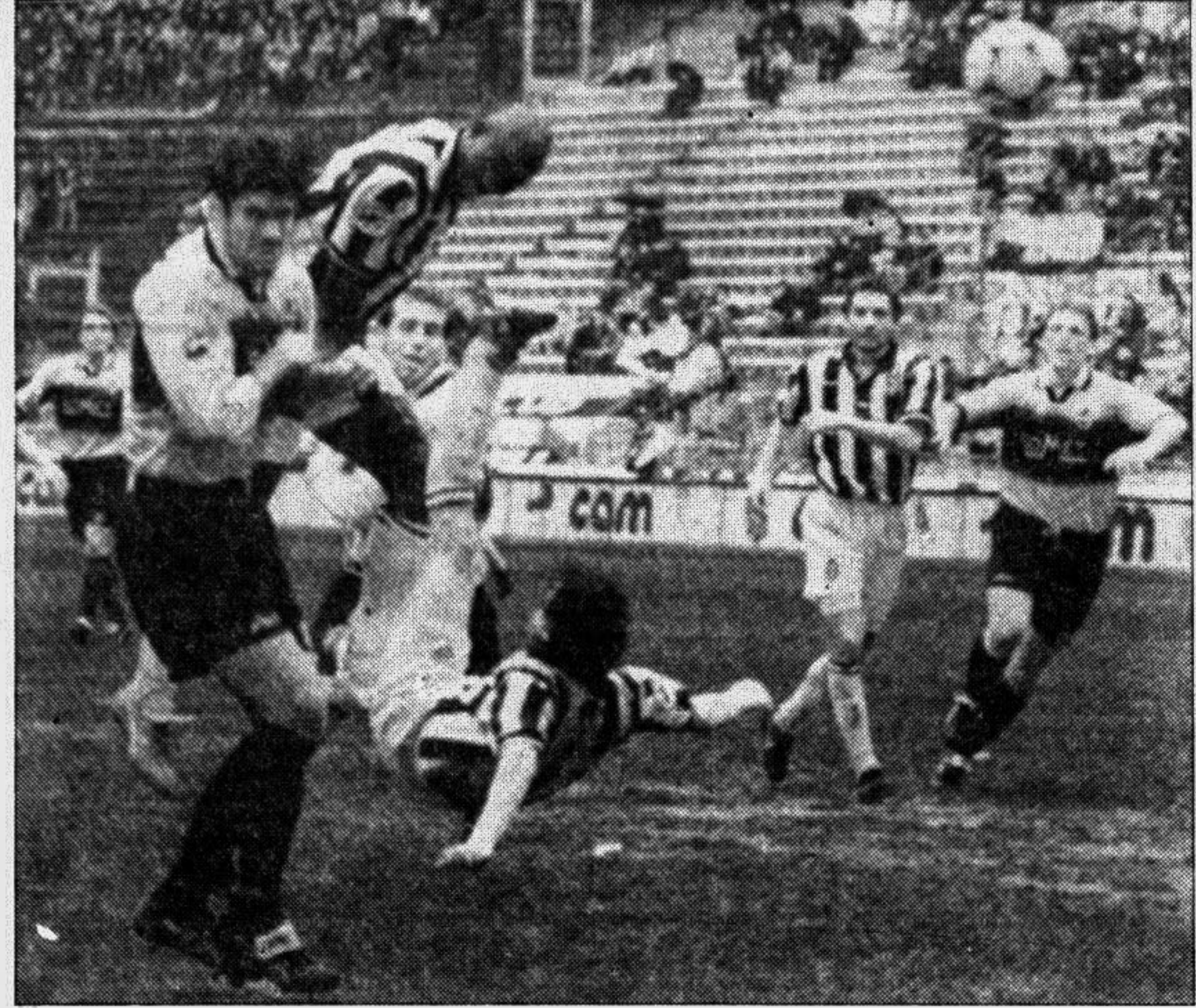
REJUVENATED: AC Milan's George Weah (shaven headed) leaps above the rest to head in one of his three goals during a Serie A match against Atlanta at the San Siro Stadium in Milan on Apr 11. Weah's hat-trick saw the local giants win 3-0.