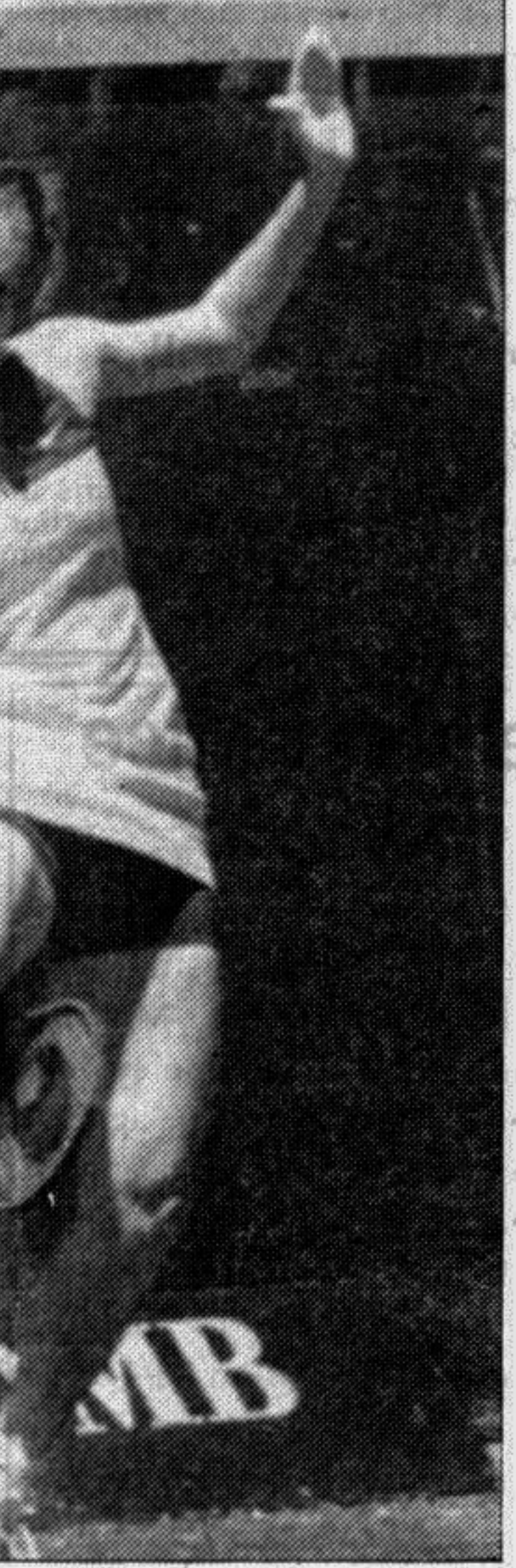
Mary Pierce of France executes a highly unorthodox return during her Bausch and Lomb Championships semifinale against American Lindsay Davenport at Amelia Island, Florida on April 11. Pierce won 4-6, 6-4, 6-3.

just short for the second year in a row, put herself in position to do just that by avenging her 1997 loss to Davenport with a 4-6, 6-3, 6-3 triumph. The last hurdle for Pierce comes in the form of Spianard Conchita Martinez, who won this tournament in 1995. The sixth seed continued her personal domination of Amanda Coetzer with a 77-minute, 6-4, 6-0 whipping of the second seed to raise her career