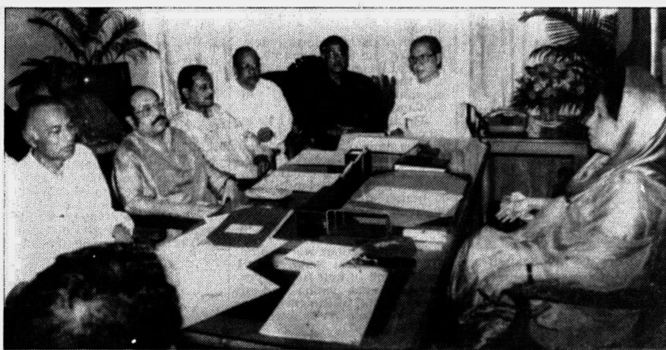
BNP Chairperson and Leader of the Opposition in Parliament Begum Khaleda Zia presiding over the party Standing Committee meeting at her Minto Road official residence in the city yesterday.