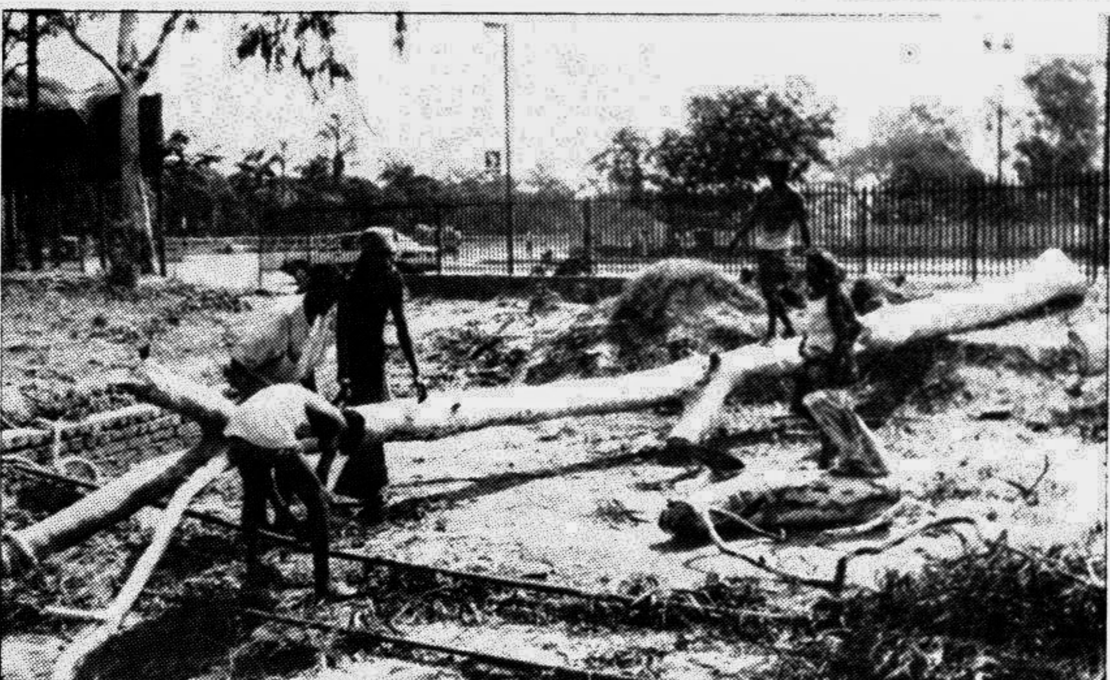
The Eucalyptus trees at Khejurbagan roundabout on Manik Mia Avenue in the city are being cut for widening the roads around.

By Staff Correspondent The condition of the three-year-old girl who was raped on Monday at North Bishil under Mirpur thana of the city further improved yesterday, CMH sources said. The girl, raped by an unidentified person at the toilet of Dargah Government Primary School at Mirpur Section One, was transferred to the Combined Military Hospital from DMCH late Monday night.