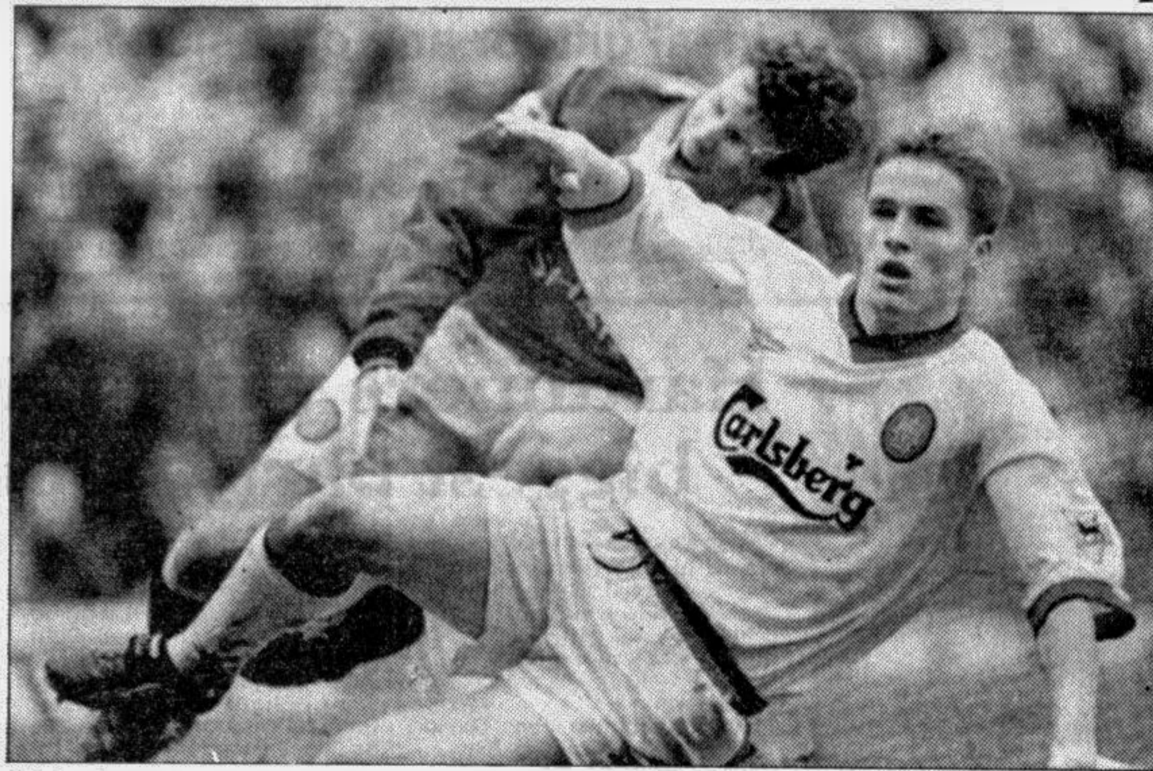
Michael Owen (R) of Liverpool and Manchester United's Ronny Johnsen are involved in a scramble during their English Premiership clash at Old Trafford on Apr 10. The match ended 1-1.

Thousands of Pakistani children have, in the past, been reported stitching balls at home and in small shops, receiving little pay for working up to 10 hours a day.