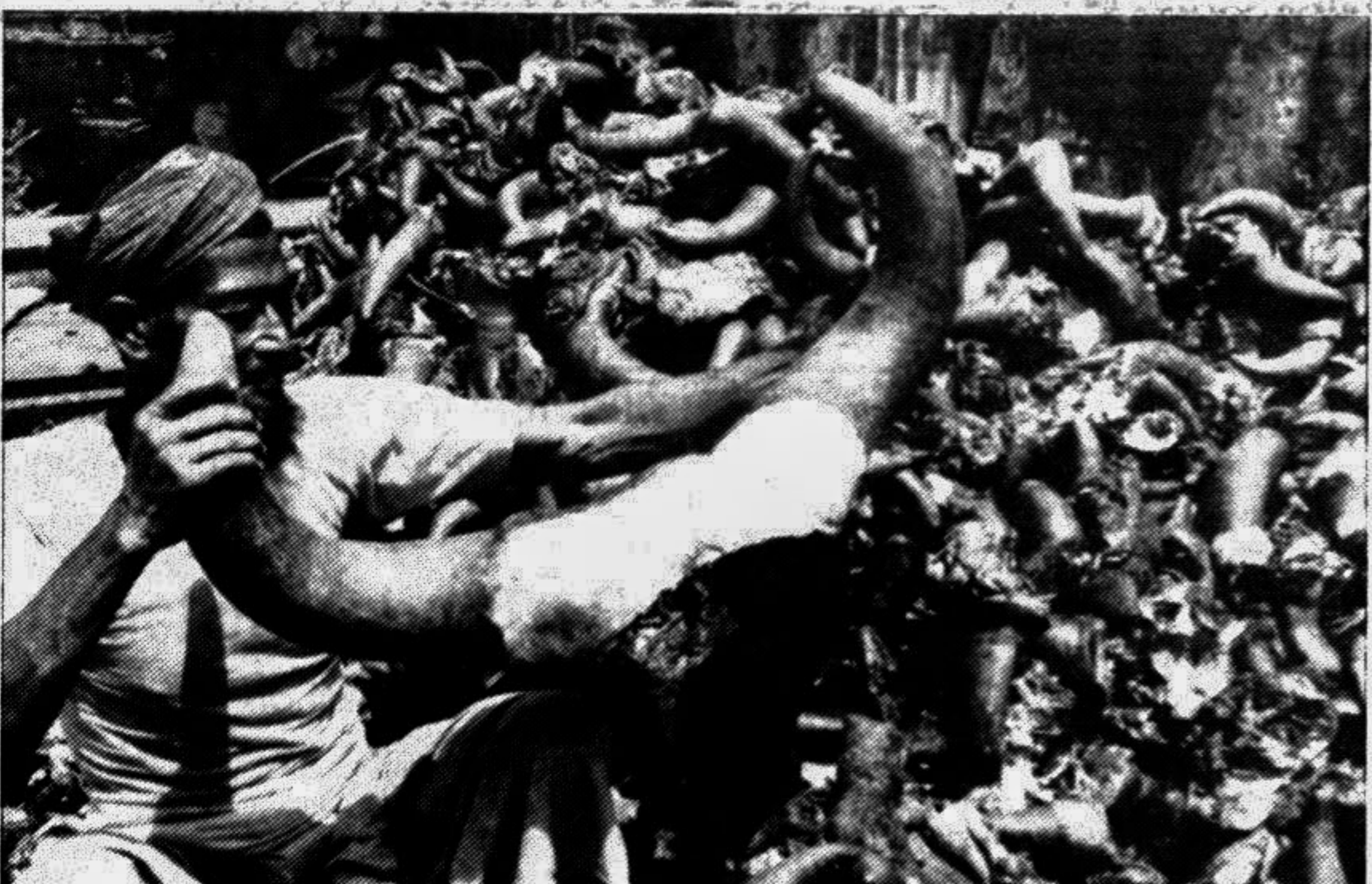
A trader checks a cattle horn amidst a pile, collected during the Eid-ul-Azha. Exporting a tonne of horn fetches him Tk 9,000. Huge quantities of horns are collected during the Eid-ul-Azha.

Foreign Minister Abdus Samad Azad yesterday met Crown Prince of Saudi Arabia Abdullah Bin Abdul Aziz at Al-Salam Palace in Jeddah, according to a message received in the city, reports UNB. The foreign minister lauded the arrangements for Hajj, including the fire-proof tents this year. On bilateral issues, the Crown Prince reiterated to further widen and deepen the relations between the two countries. He hoped that the government and all others would take all measures to improve the law and order situation so that people of Bangladesh could prosper economically and improve the quality of life of the people. Azad conveyed to him the greetings of the President and the Prime Minister. In reply, the Crown Prince conveyed the greetings of the custodian of the two holy mosques and his greetings to the President, Prime Minister and people of Bangladesh.