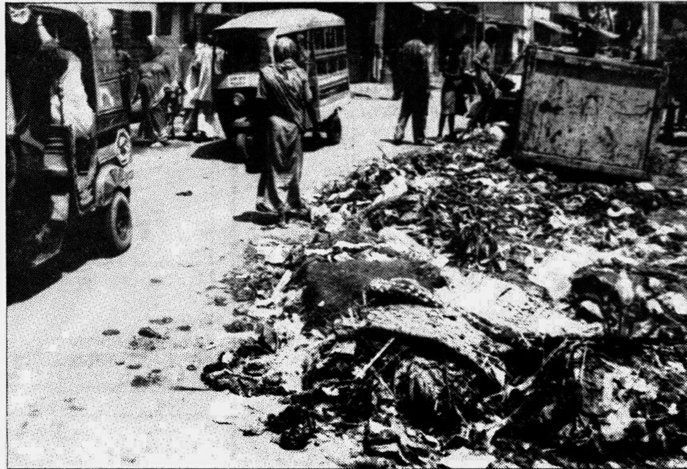
Entrails of sacrificial animals piled up on a road in Azimpur area of the city.

manpower recruiting rackets as well as scrupulous employers. Clackdown on foreign workers having no legal document was also continuing. Meanwhile, officials in Dhaka said that the authorities were desperately trying for waiving of the compoand. But one official noted, 'We have no locus standi to fight for the causes of workers who went to Malaysia illegally, be it because of their faults or because of unscrupulous recruiting agents.' Minister for Labour and Manpower MA Mannan told this correspondent, 'We are trying to plug loopholes, taking advantage of which rackets export people illegally that earns a bad name for Bangladesh.' He contested a recent claim by Malaysian human rights activist Irene Fernandez that 5,000 Bangladeshis were in jails. Mannan said, 'There are hardly 1,500 Bangladeshis in different jails in Malaysia and most of them fell prey to unscrupulous employers.' He, however, added that a detailed report on the latest condition of Bangladeshi workers in Malaysia would be available to him shortly.