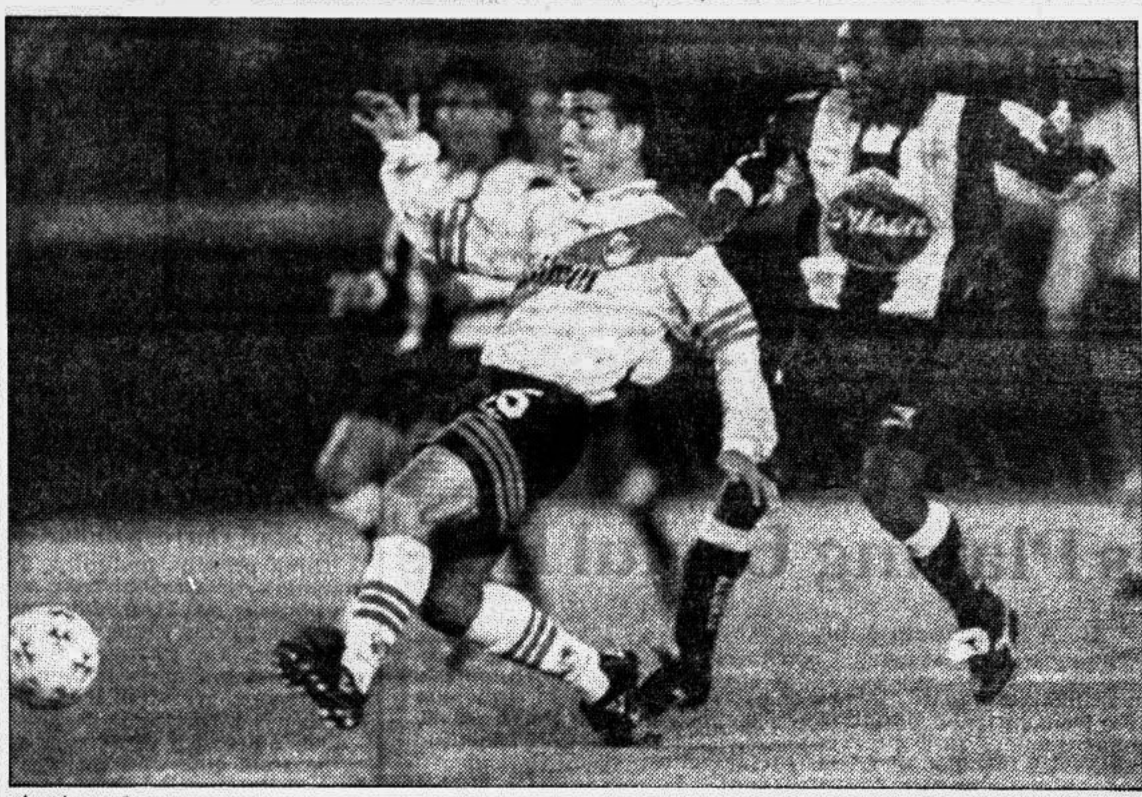
Action from the Libertadores Cup fixture between River Plate (Argentina) and Alianza (Peru) at Buenos Aires on Apr 9.

The second test was conducted by the International Amateur Athletic Federation, after the athlete protested results of the test showing Nandrolone, a banned steroid, in her urine. The local association backed her demand for another test.