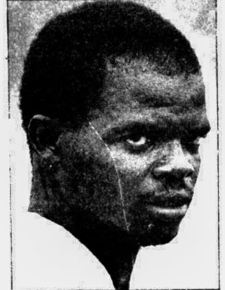
LAMBERT ... p-o-m

ENGLAND Knight run out 65 Stewart c Hooper b Tuckett 12 B Hoolioake run out 2 Hick c Chanderpaul b Tuckett 1 Ramprakash c McGarrell b Hooper 51 A Hoolioake b McGarrell 2 Elham c L Williams b Chanderpaul 26 Brown st Jacobs b Hooper 13 Fleming c L Williams b S Williams 10 Croft not out 13 Fraser run out 30 Extras: (lb-6, w-12, nb-2) 20 Total: (45.5 overs) 245 Fall of wickets: 1-41; 2-60; 3-71; 4-109; 5-115; 6-161; 7-186; 8-196; 9-207