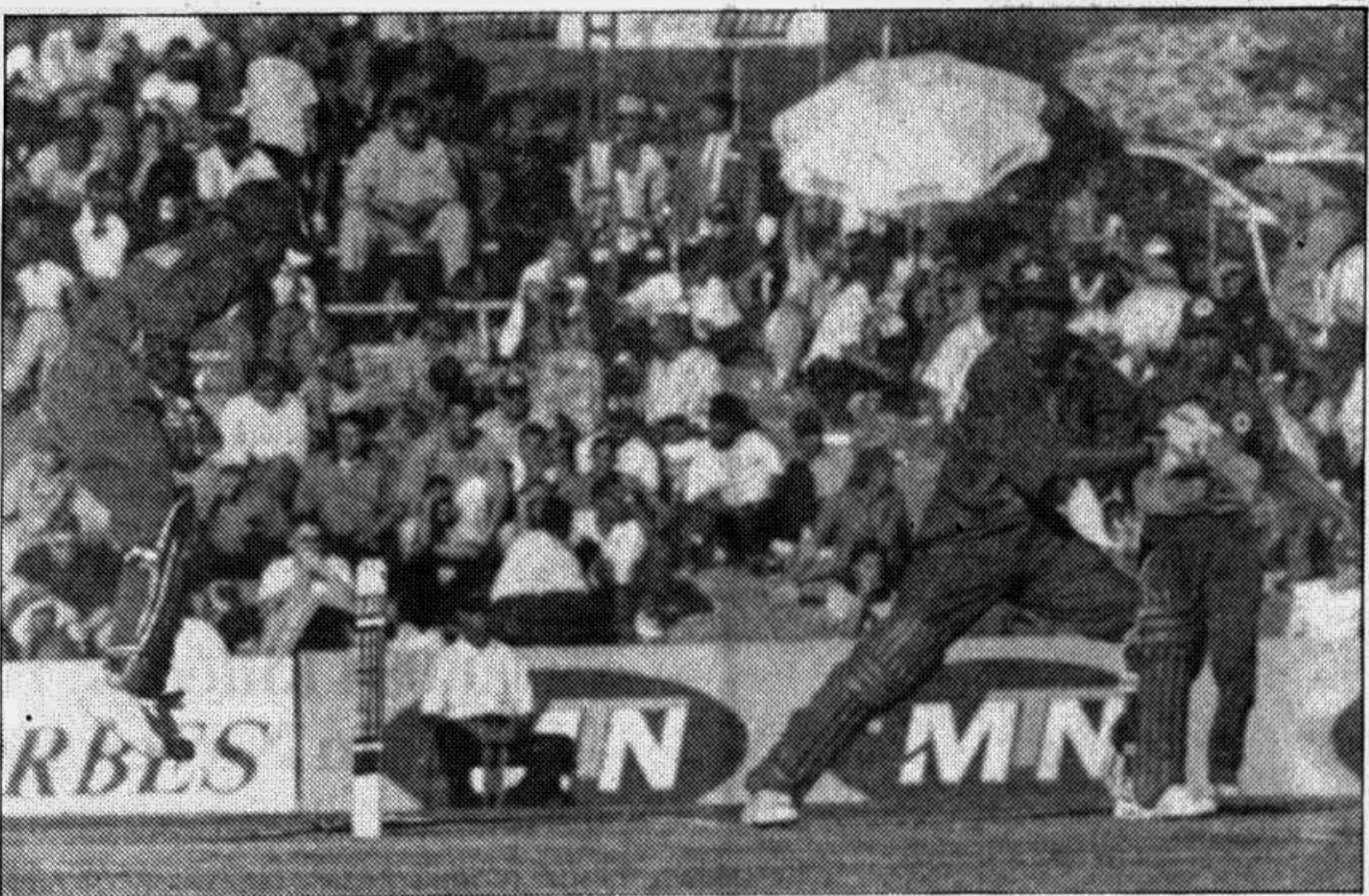
Romesh Kaluwitharana, the Sri Lankan wicketkeeper, jumps to gather a delivery which Pakistan skipper Rashed Latif has missed during their triangular series match at Paarl on April 9.

MILAN, Apr 10: George Weah headed in a freak winner in the final minute here on Wednesday night as AC Milan snatched a 1-0 victory over Lazio in the first leg of the Italian Cup final, reports AFP.