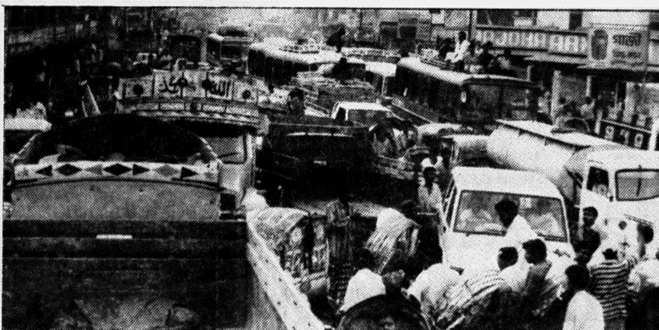
The road between Tikatoli and Jayakali Mandir experienced heavy traffic congestion yesterday.

Chittagong Grammar School Mehdiabag/Panchaliash, Chittagong D-155