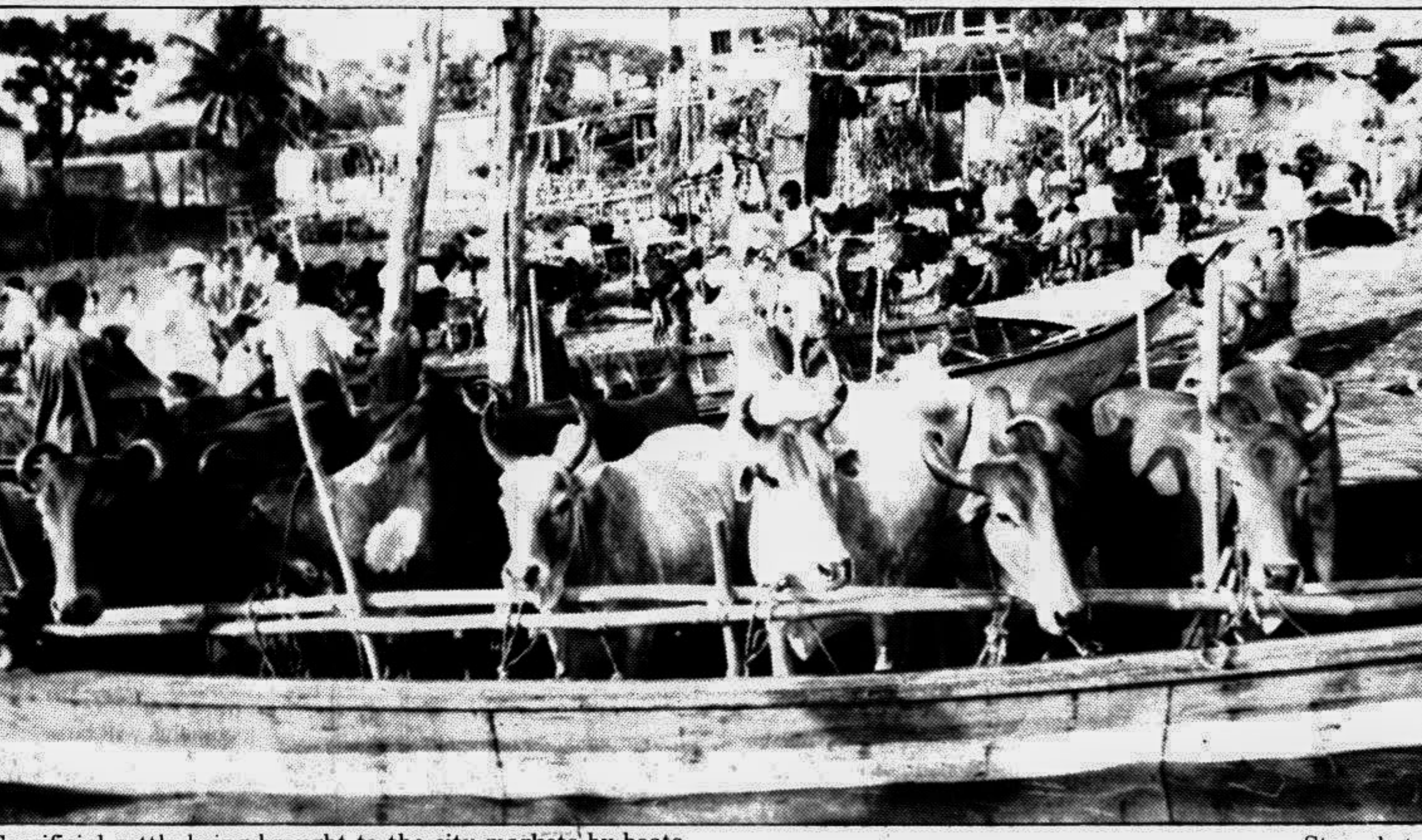
Sacrificial cattle being brought to the city markets by boats.

The government will encourage setting up of area-based small power plants of up to 10 megawatt in the private sector all over the country, including Dhaka city, reports UNB. Any individual or organisation can take the advantage of setting up such plants, said a government handout yesterday. Interested persons or organisations have been requested to contact the Ministry of Power, Energy and Mineral Resources directly. Meanwhile, Prime Minister Sheikh Hasina yesterday directed the officials concerned to expedite the work of 132 KV power line from Chittagong to Comilla. She has the directive at a meeting that reviewed country's