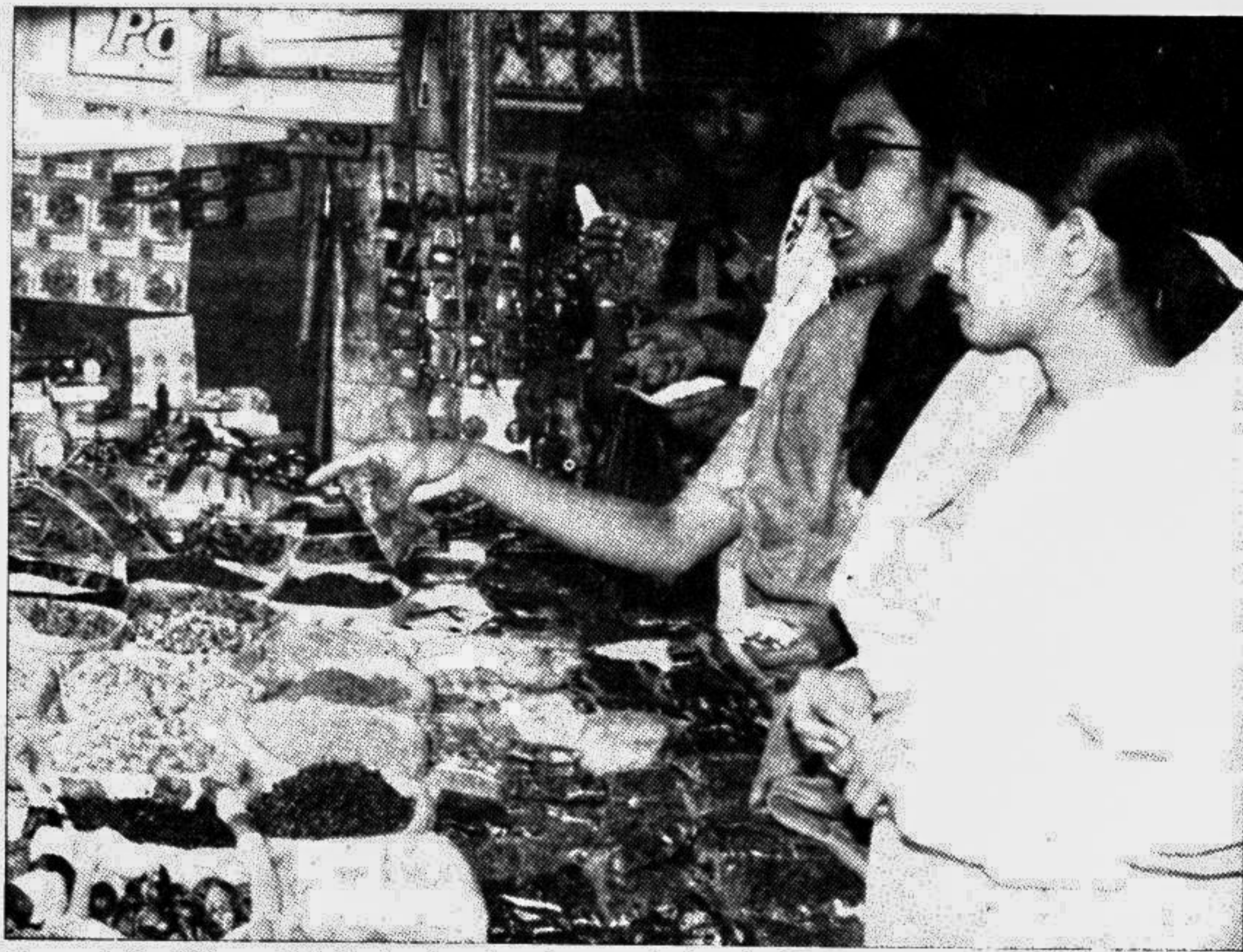
Demand for different kind of spices has increased ahead of Eid-ul-Azha.

CSE ready to go on-line EU nations express confidence in Asia's economic recovery Pages 6, 7