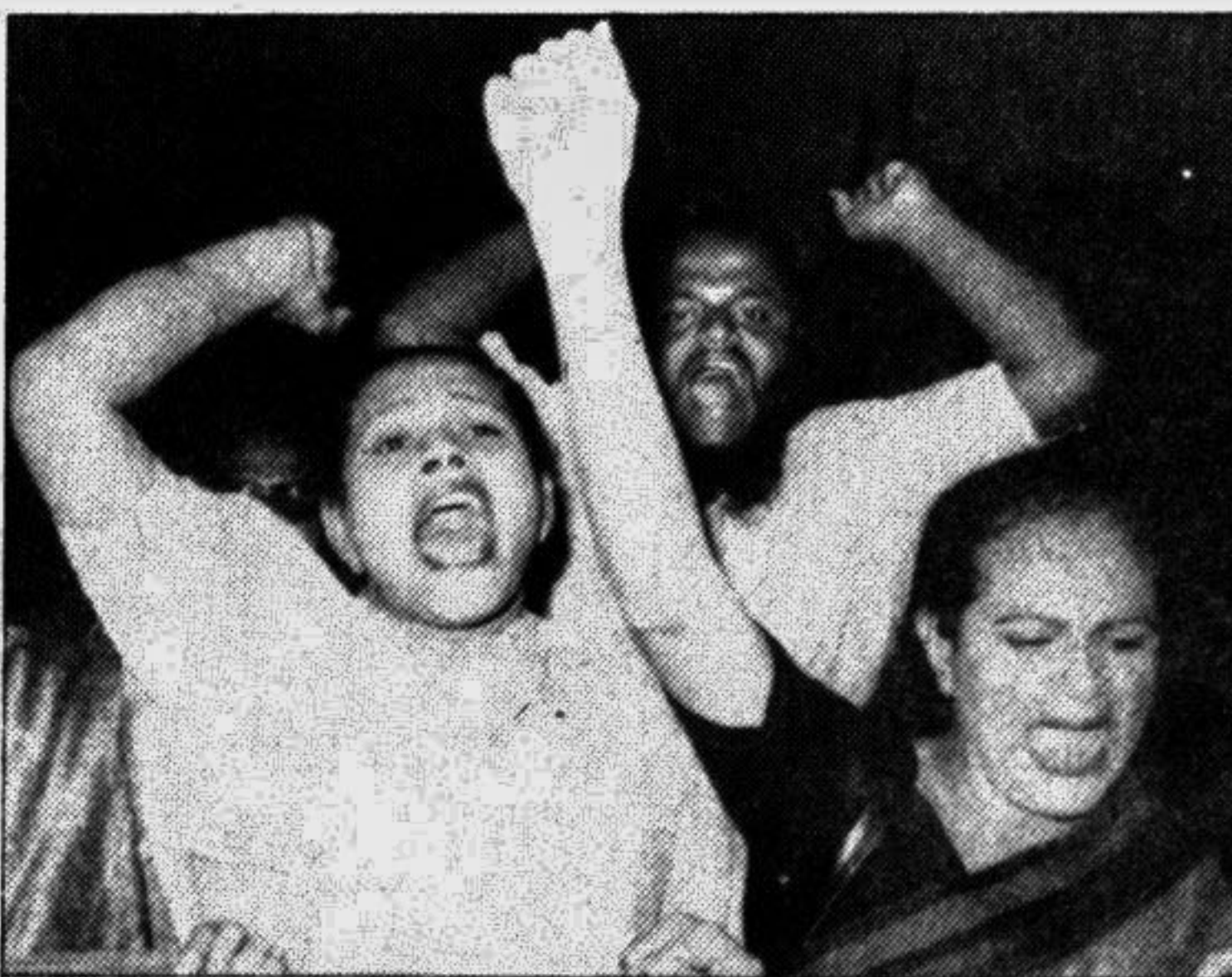
Garments Srämik Oikya Parishad staged a demonstration in the city yesterday demanding payment of salary and bonus before Eid-ul-Azha.

Although Forest Department filed cases with Sudharam thana, nothing except the arrest of one, had happened so far, forest officials said.