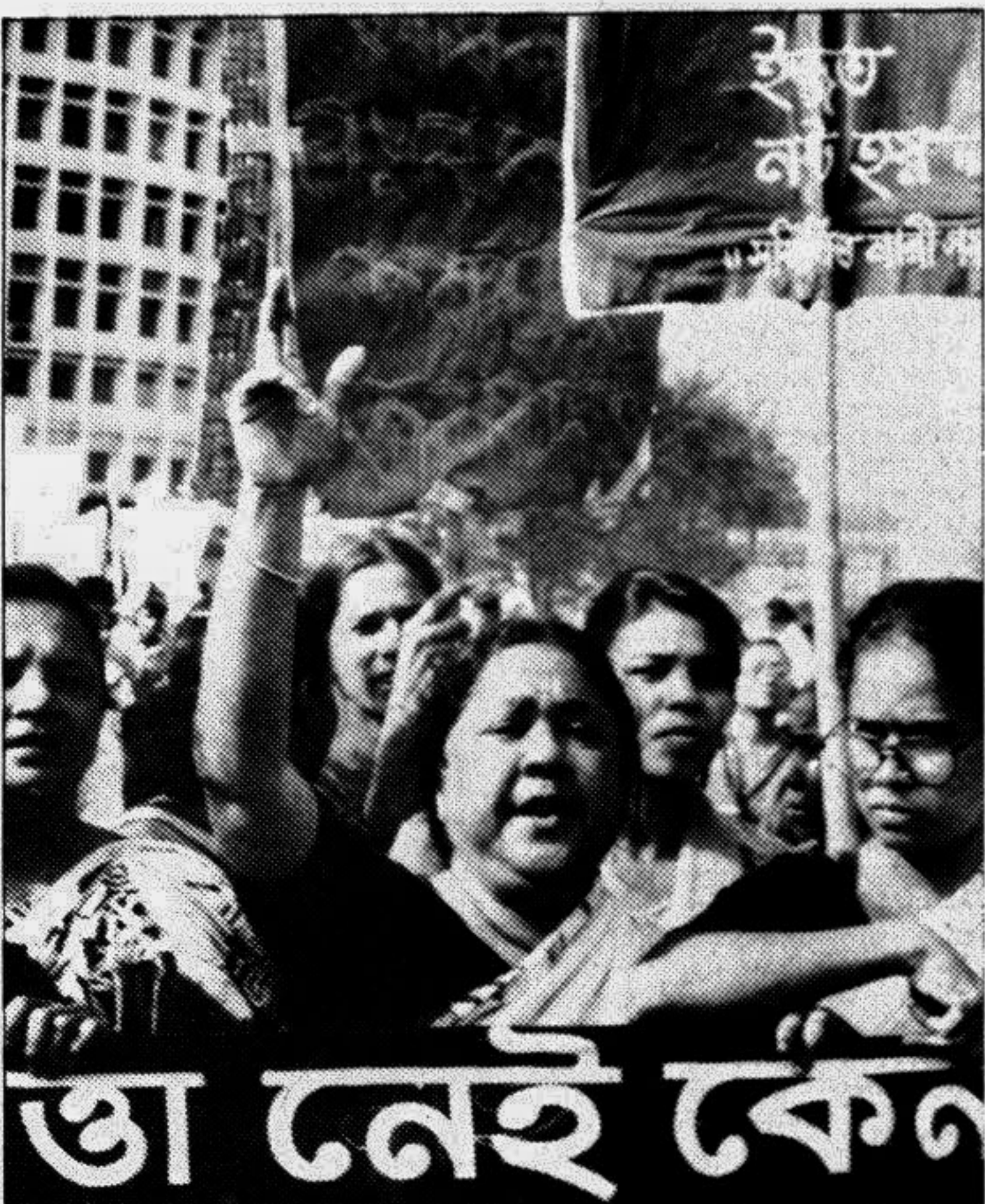
Sammita Nari Samaj brought out a procession in the city yesterday protesting violence against women and children.

From Page 1 the-people" programme at the AL central office at Bangabandhu Avenue yesterday. The Commerce and Industries Minister said, 48 Least Developed Countries (LDCs) would get zero-tariff access in export to developed countries after the upcoming second-round minister-level meeting in Geneva on May 16 and 17. He said it was Bangladesh, as leader of the LDCs, made this proposal in the previous meetings in Singapore and Geneva.