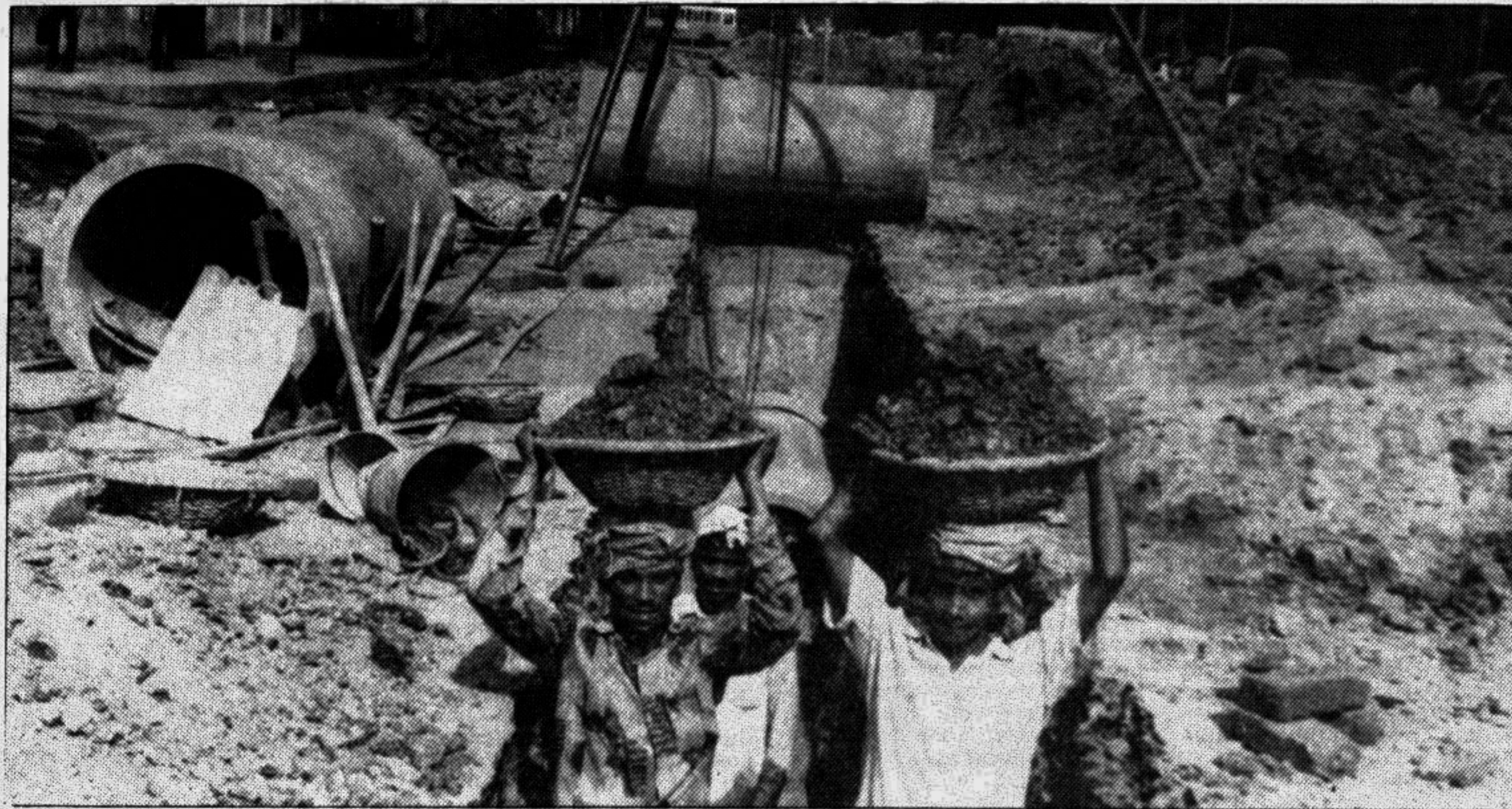
With the advent of the rainy season, road digging activities by various city agencies seen to have picked up. This picture shows work going on in full swing on the Dhaka University campus yesterday.