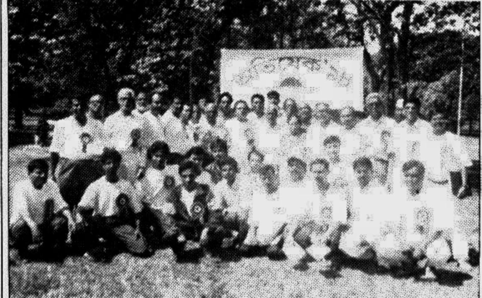
The installation ceremony of the new executive committee and advisory council of Ramna Usha Sangha was held in the city recently.