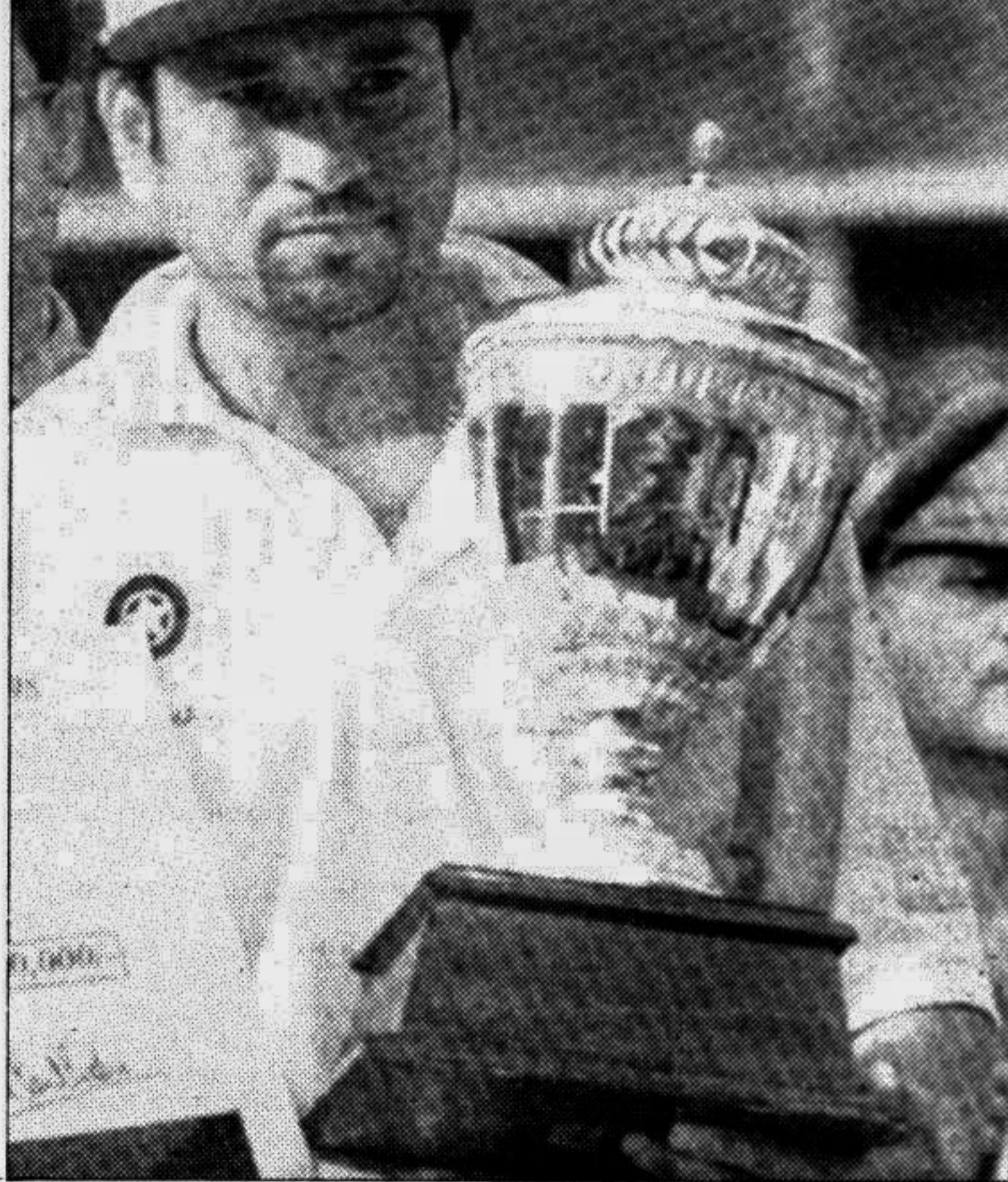
MAN OF THE MOMENT: Sachin Tendulkar poses with the player-of-the-series trophy at the end of the third and final Test against Australia at Bangalore on March 28.

Australia move on to the triangular one-day series, with India and Zimbabwe under the leadership of Steve Waugh.