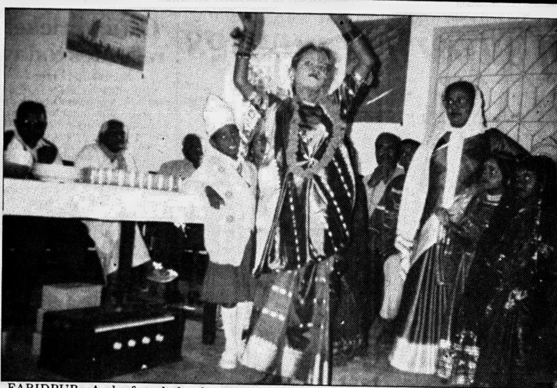
FARIDPUR: A deaf and dumb girl student of Hicare School in the town recently presented a dance at a cultural programme here.