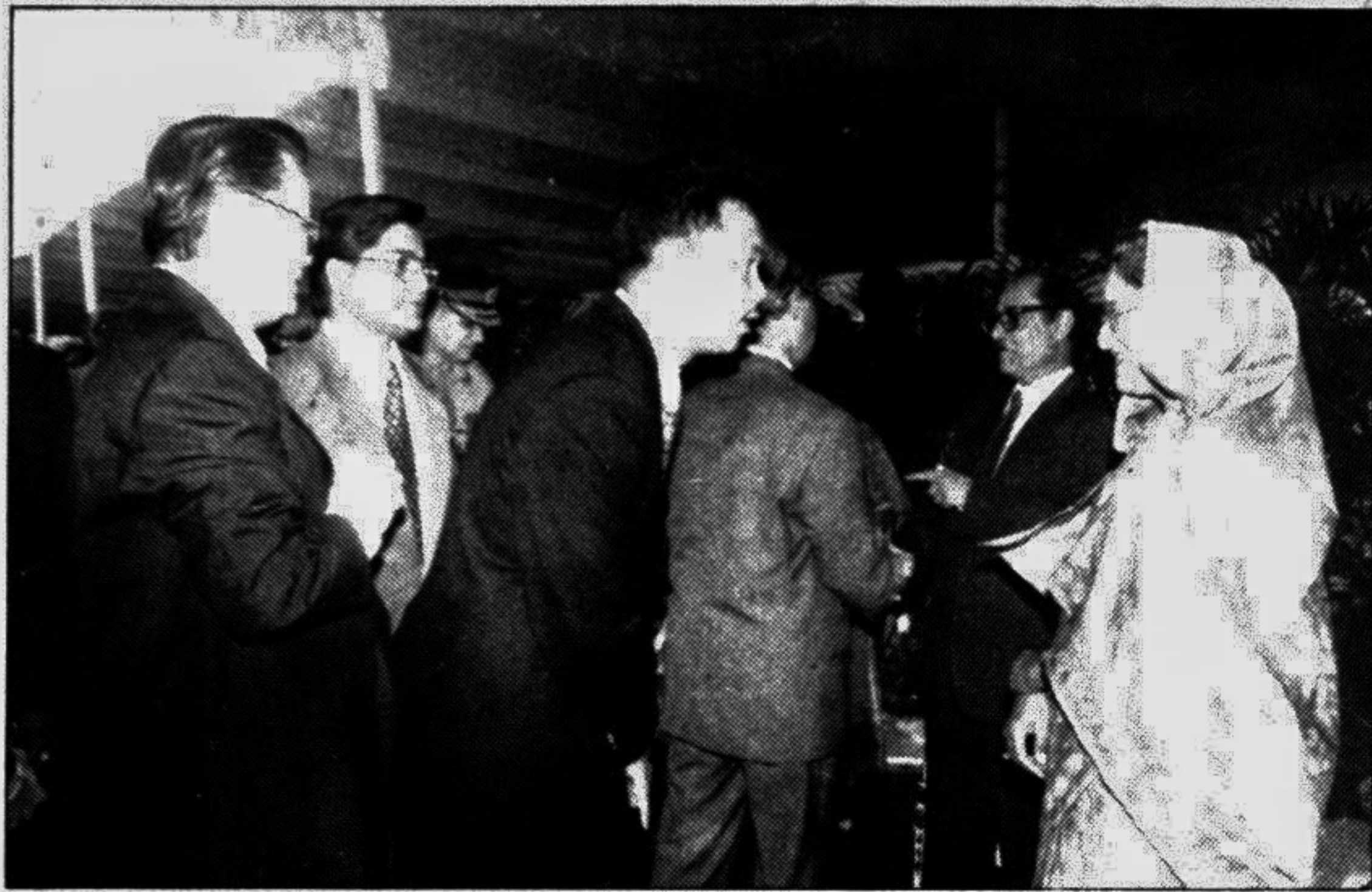
President Shahabuddin Ahmed and Prime Minister Sheikh Hasina exchanging greetings with foreign diplomats at Bangabhaban on Independence and National Day.