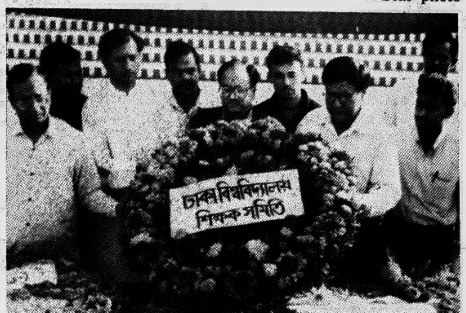
Dhaka University Teachers' Association