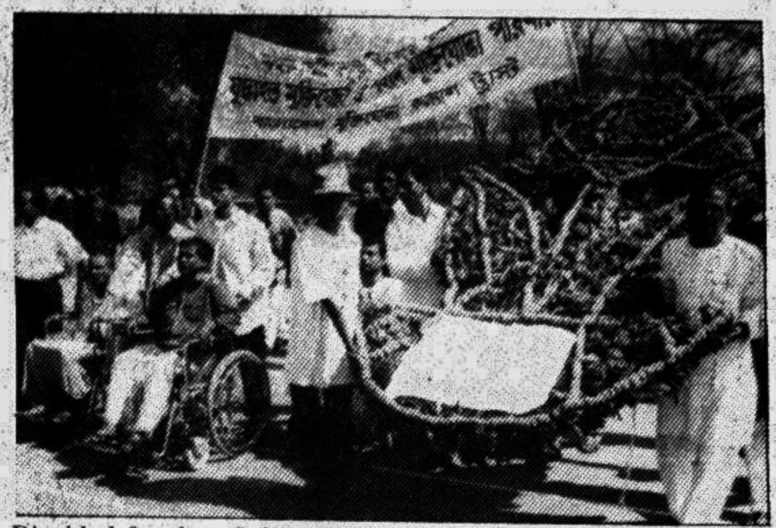
Disabled freedom fighters and their family members