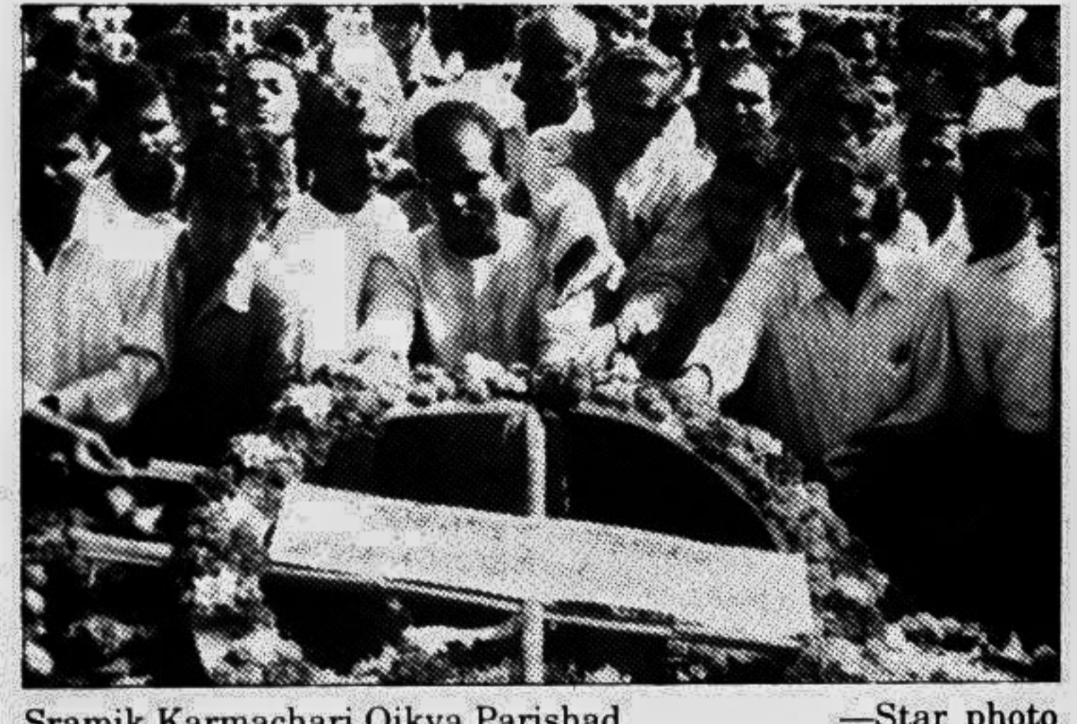
Sramik Karmachari Oikya Parishad