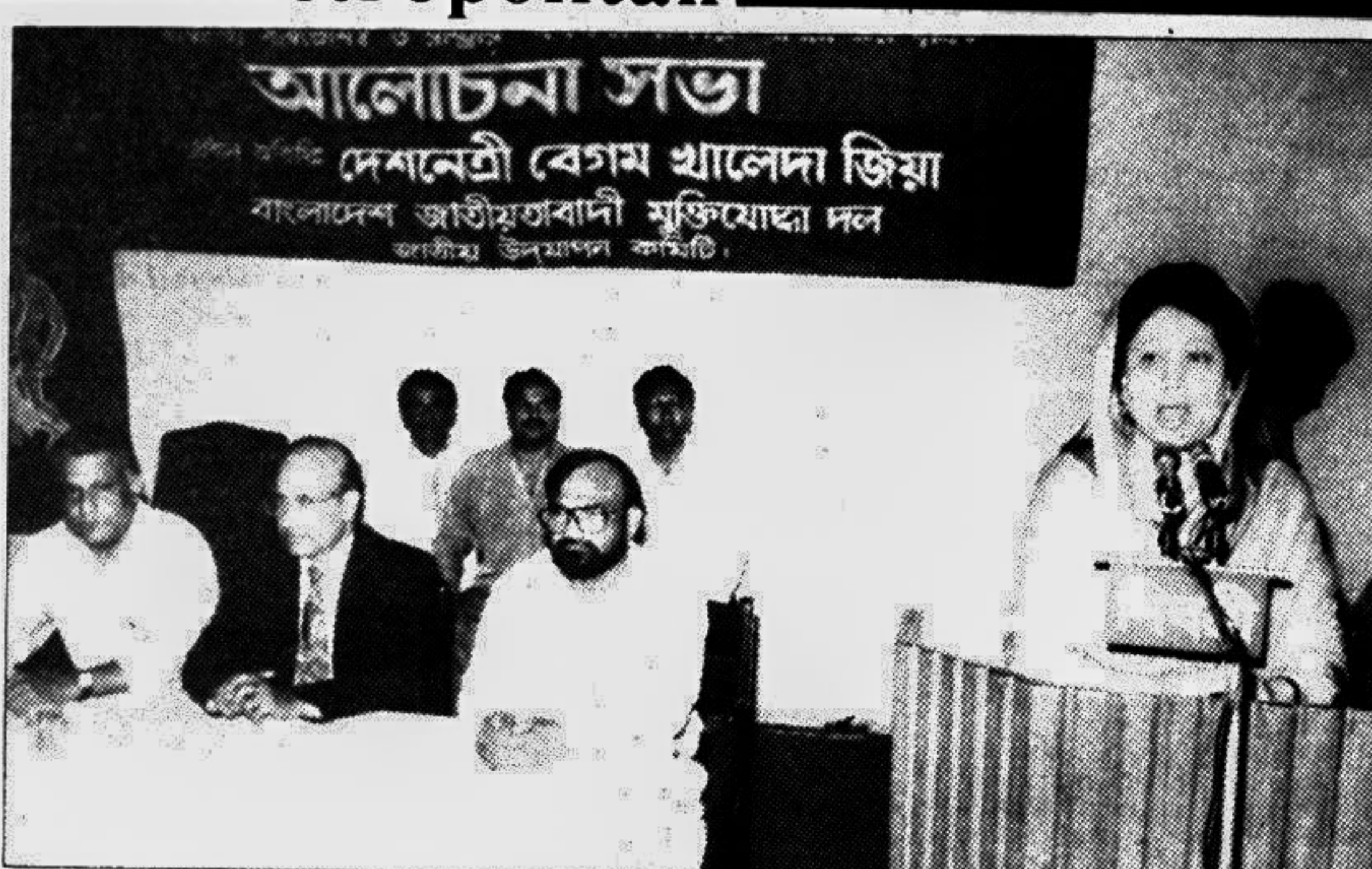
Leader of the Opposition and BNP Chairperson Begum Khaleda Zia speaking at a discussion meeting organised by the Bangladesh Jatiyatabadi Muktiyoddha Dal in the city yesterday.