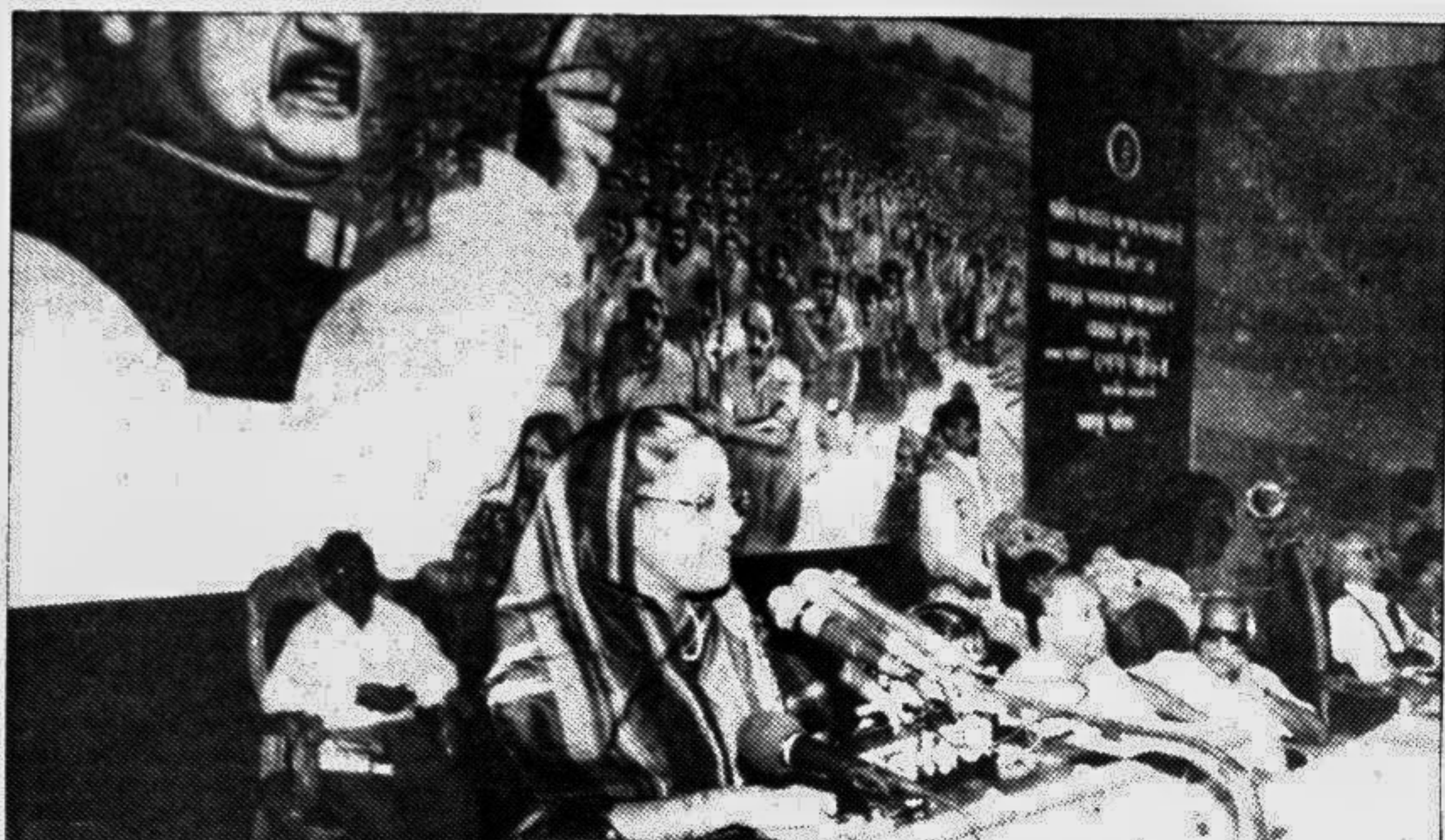
Prime Minister Sheikh Hasina addressing a discussion meeting on the occasion of Bangabandhu's 78th birth anniversary and Independence Day as chief guest. The programme was organised by the Bangabandhu Parishad at the Ramna Batamul in the city yesterday.