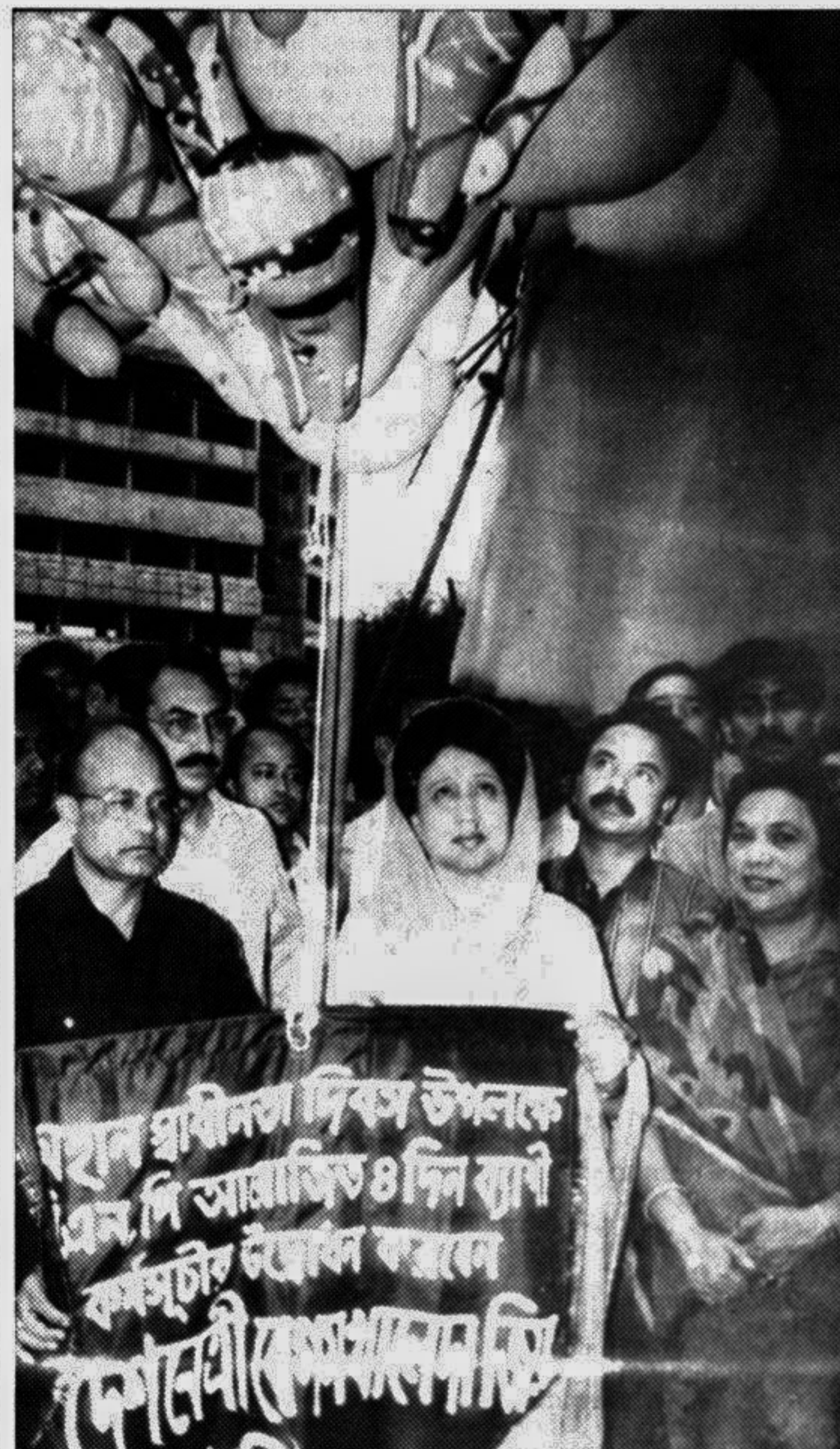
BNP Chairperson Begum Khaleda Zia inaugurating a four-day party programme in observance of Independence Day on the Diploma Engineers' Institute premises in the city yesterday.