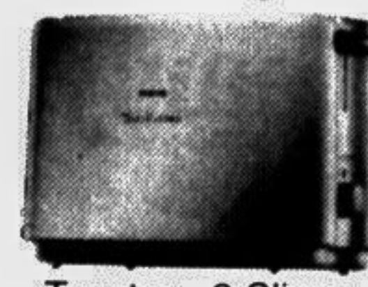
Toaster - 2 Slices

Transcom Electronics Limited Official licensee of Philips Electronics N.V. for lighting products, radio and TV sets Dhaka: 815307-10, 819625-9 Ctg.: 716353, 723578 Khulna: 720304, Bogra: 6215