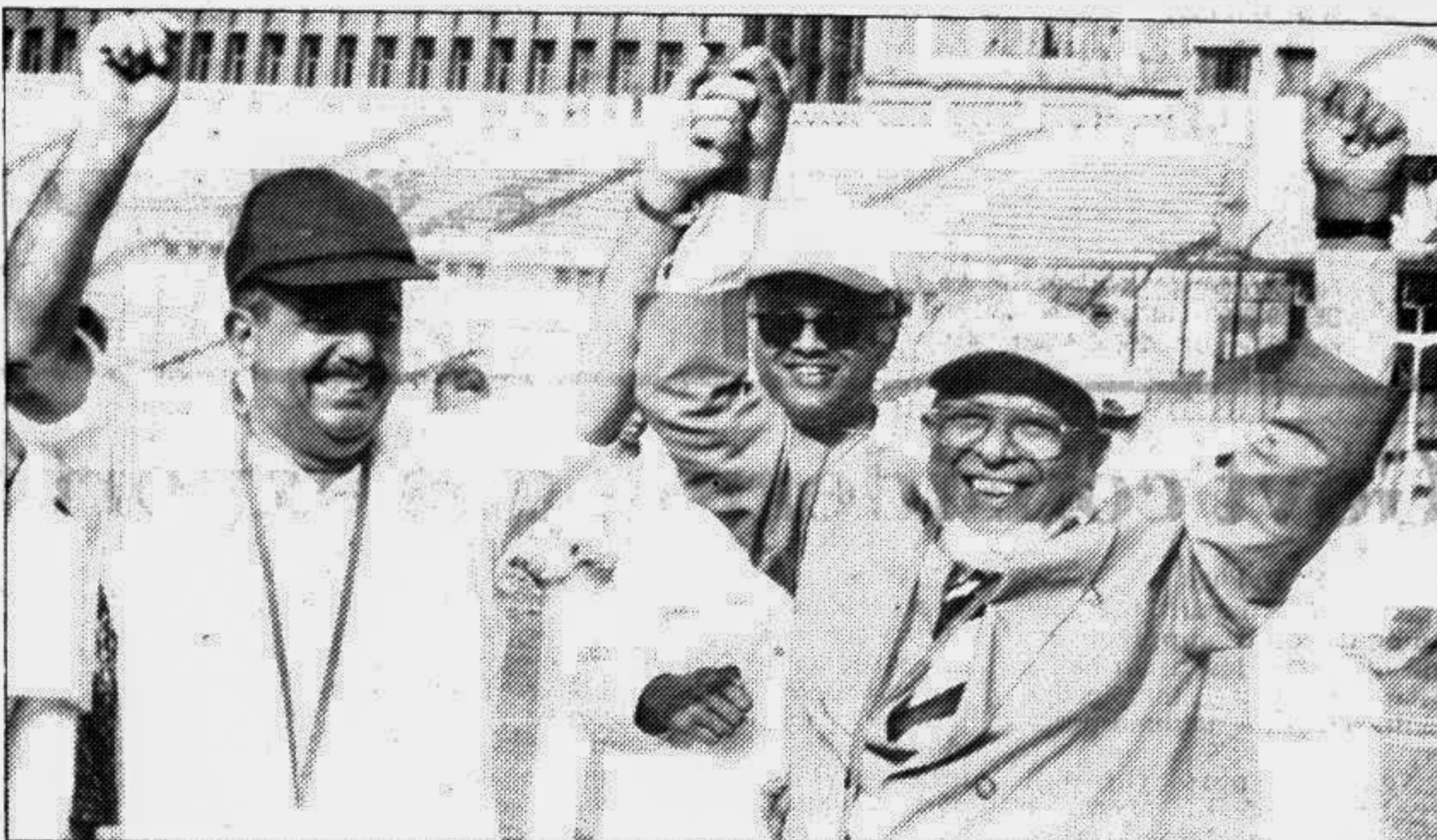
Foreign Minister Abdus Samad Azad (R) having some fun before the start of the friendly cricket match between his ministry and the foreign missions at the Dhaka Stadium yesterday.

For injury reasons, both Sohail and Akram missed out Pakistan's first Test against the Zimbabwe in Bulawayo that saw the tourists barely managing a draw in the face of a good show put up by the hosts.