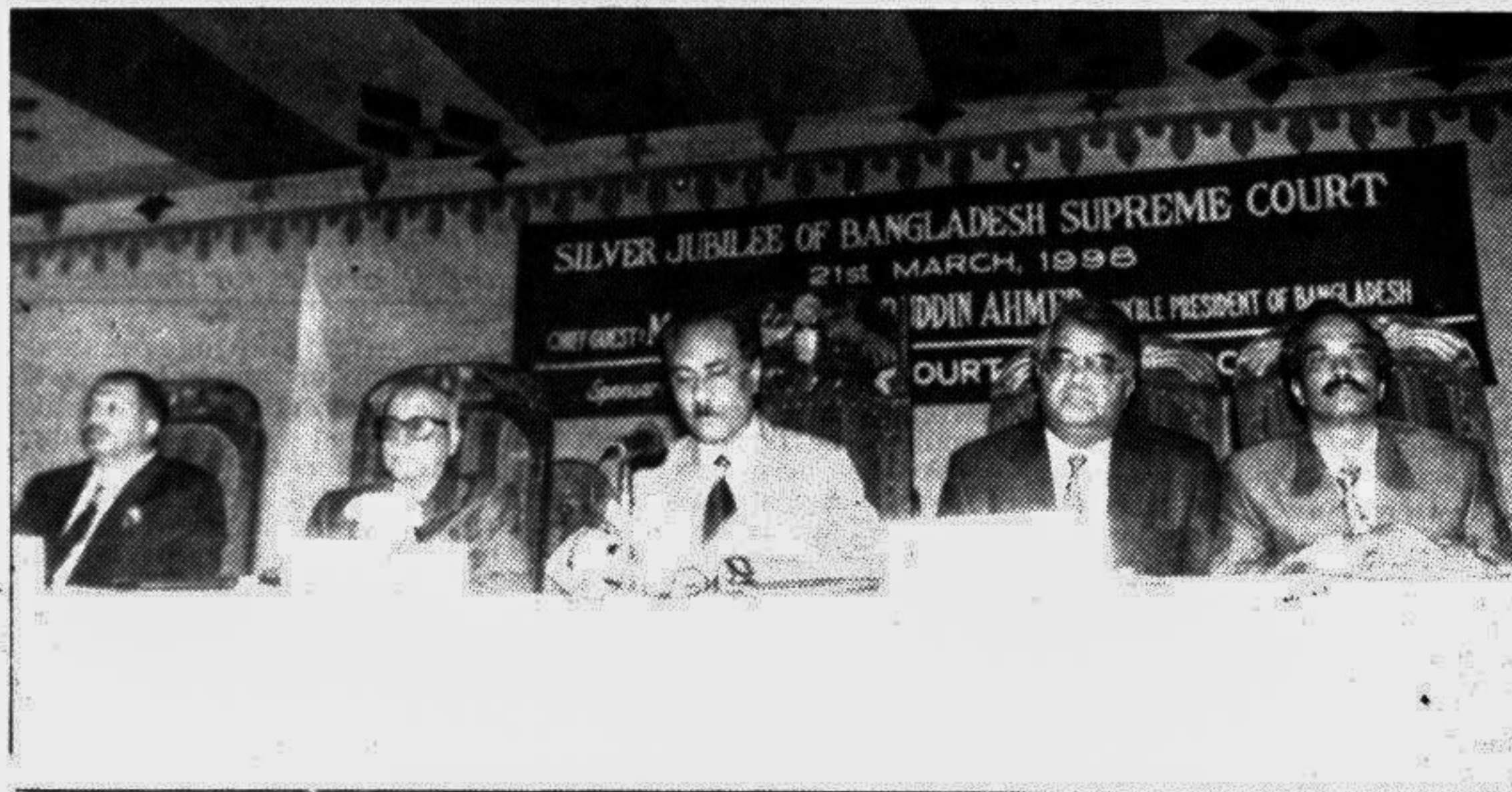
President Justice Shahabuddin Ahmed addressing the Silver Jubilee ceremony of the Bangladesh Supreme Court in the city yesterday.