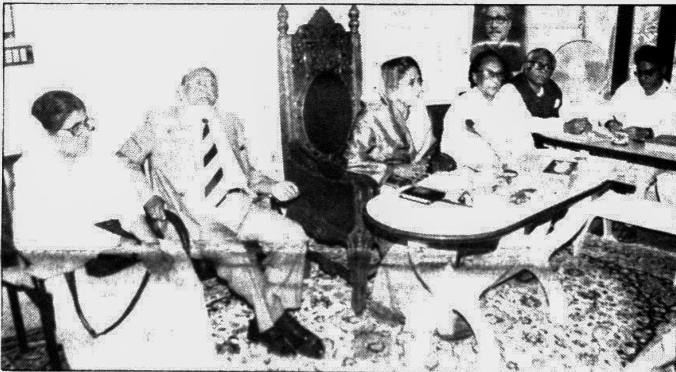
Prime Minister Sheikh Hasina presided over Awami League Central Working Committee meeting at AL presidium member Amir Hossain Amu's residence in the city yesterday.

About 200 medical teachers, administrators and students from home and abroad are participating in the two-day conference.