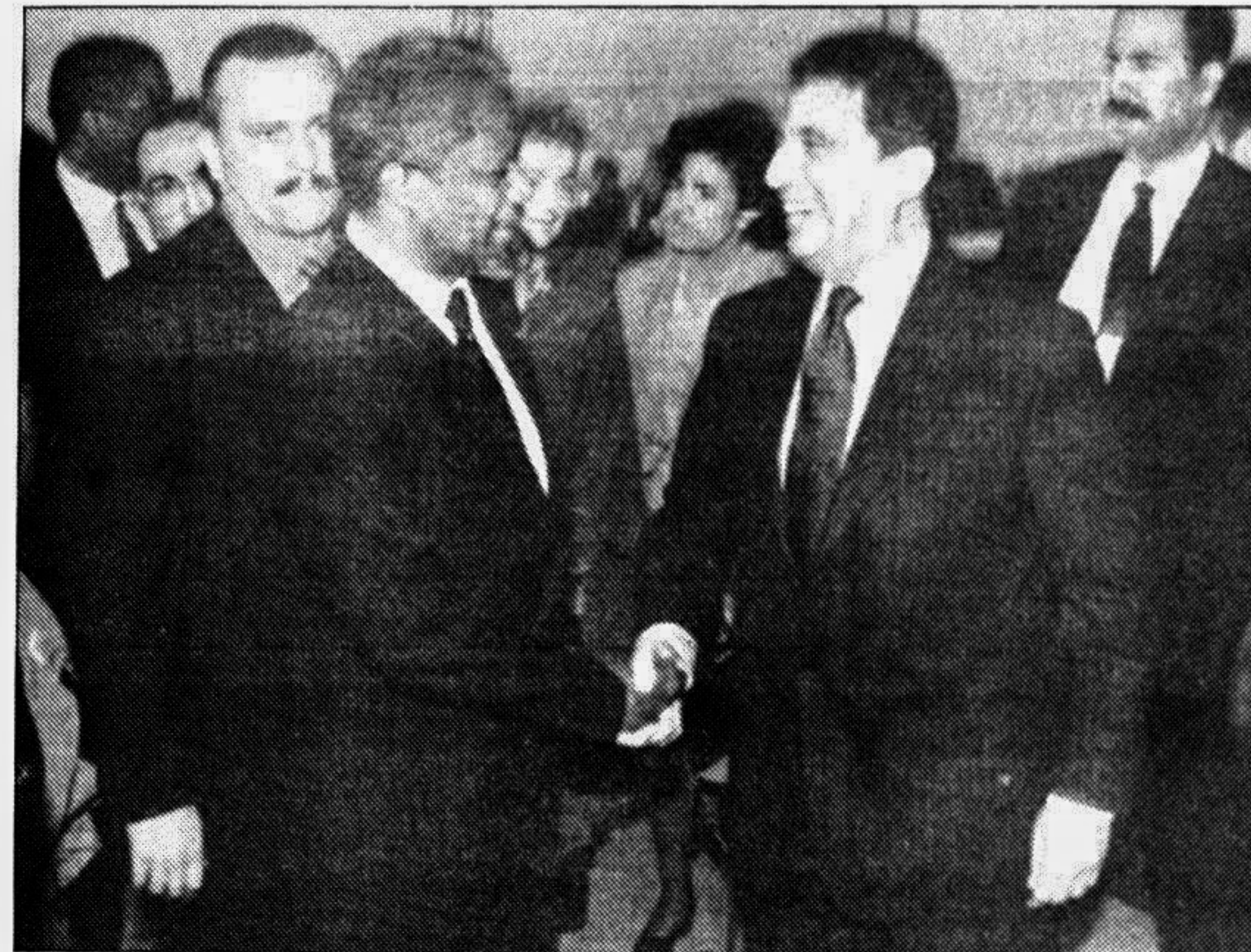
Egyptian Foreign Minister Amr Moussa greets UN Secretary-General Kofi Annan at Cairo Airport Wednesday. Annan arrived from Amman, Jordan and is on the second leg of a Middle East tour that will also include Syria, Gaza and Israel.

Albright said Washington was "dedicated to making the process move forward. We are looking at how to proceed and looking at the pacing in terms of the ideas that we have presented to the parties."