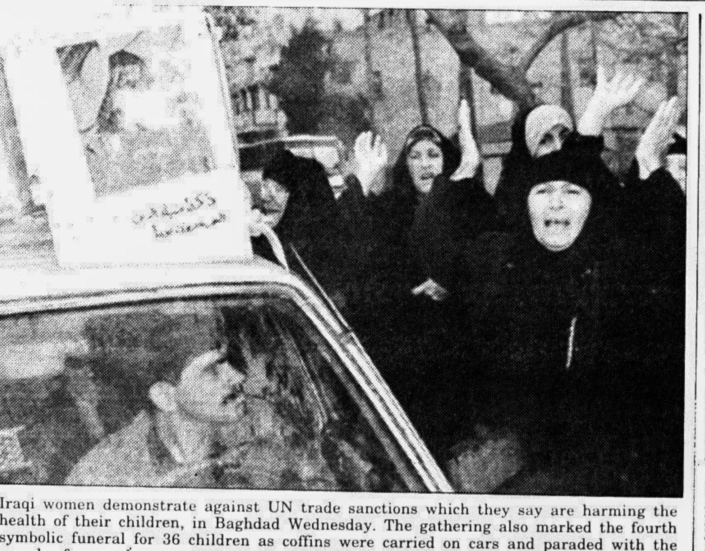
Iraqi women demonstrate against UN trade sanctions which they say are harming the health of their children, in Baghdad Wednesday. The gathering also marked the fourth symbolic funeral for 36 children as coffins were carried on cars and paraded with the crowds of angry demonstrators.