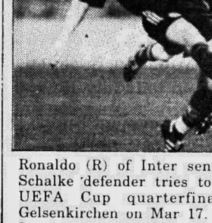
Ronaldo (R) of Inter sends a through pass while a Schalke defender tries to make contact during their UEFA Cup quarterfinal second leg match at Gelsenkirchen on Mar 17. The match ended 1-1 giving Inter a 2-1 aggregate victory.