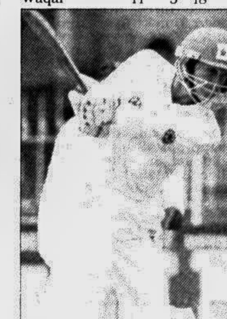
A FLOWER ... 100 n.o. Shaoh 23.2 5 67 2, Mahmood 24 1 102 0, Naqvi 2 0 11 0, Saqlain 15 0 65 0, Anwar 4 0 19 0, Inzamam 1 0 6 0