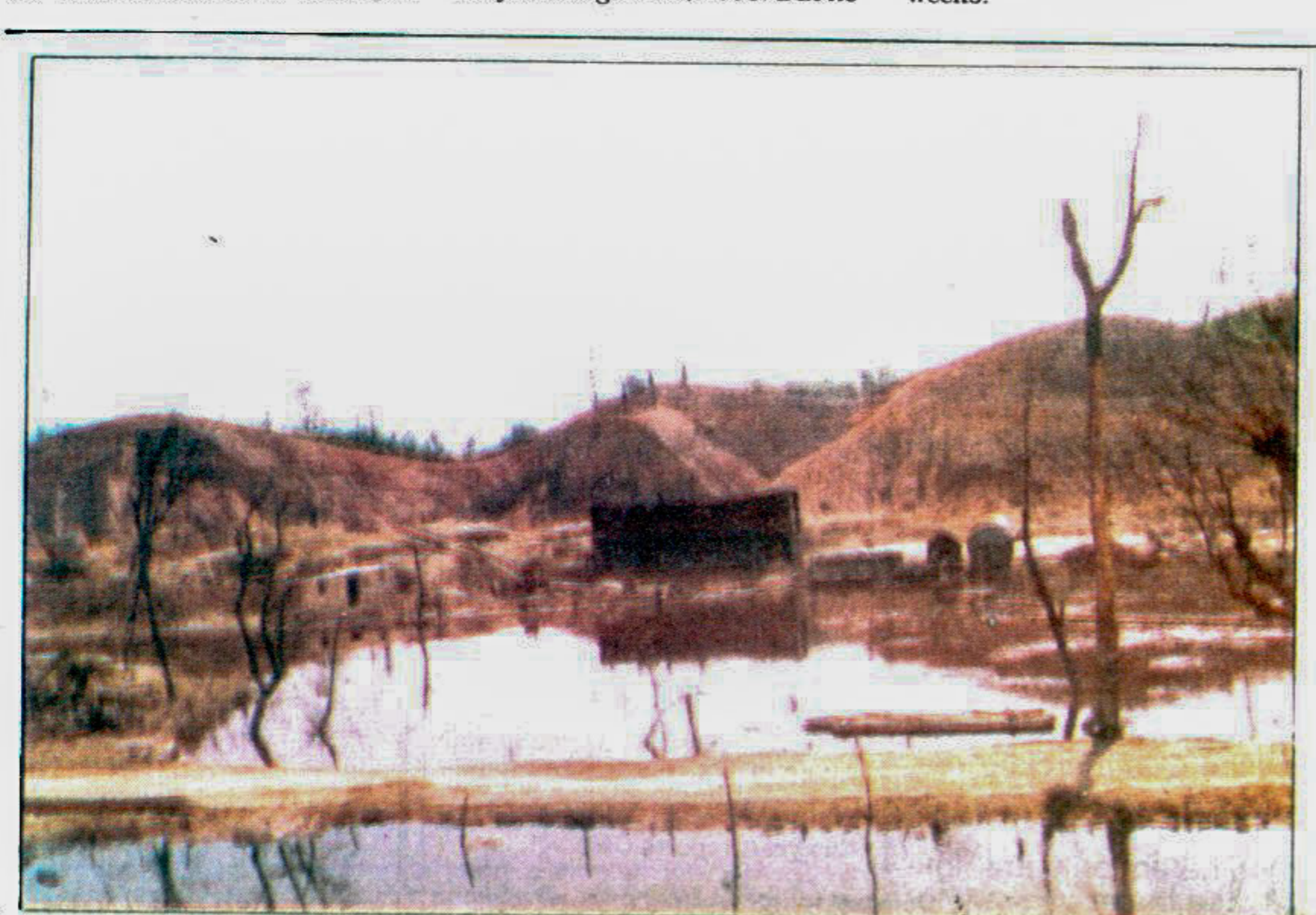
The abandoned drilling site of Occidental at Magurchhara, which was damaged in an explosion in June last.