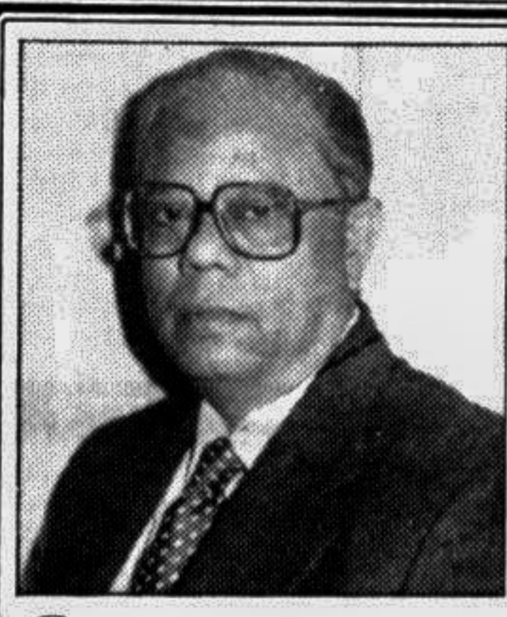
CHEHLUM AND PRAY FOR HIS DEPARTED SOUL.