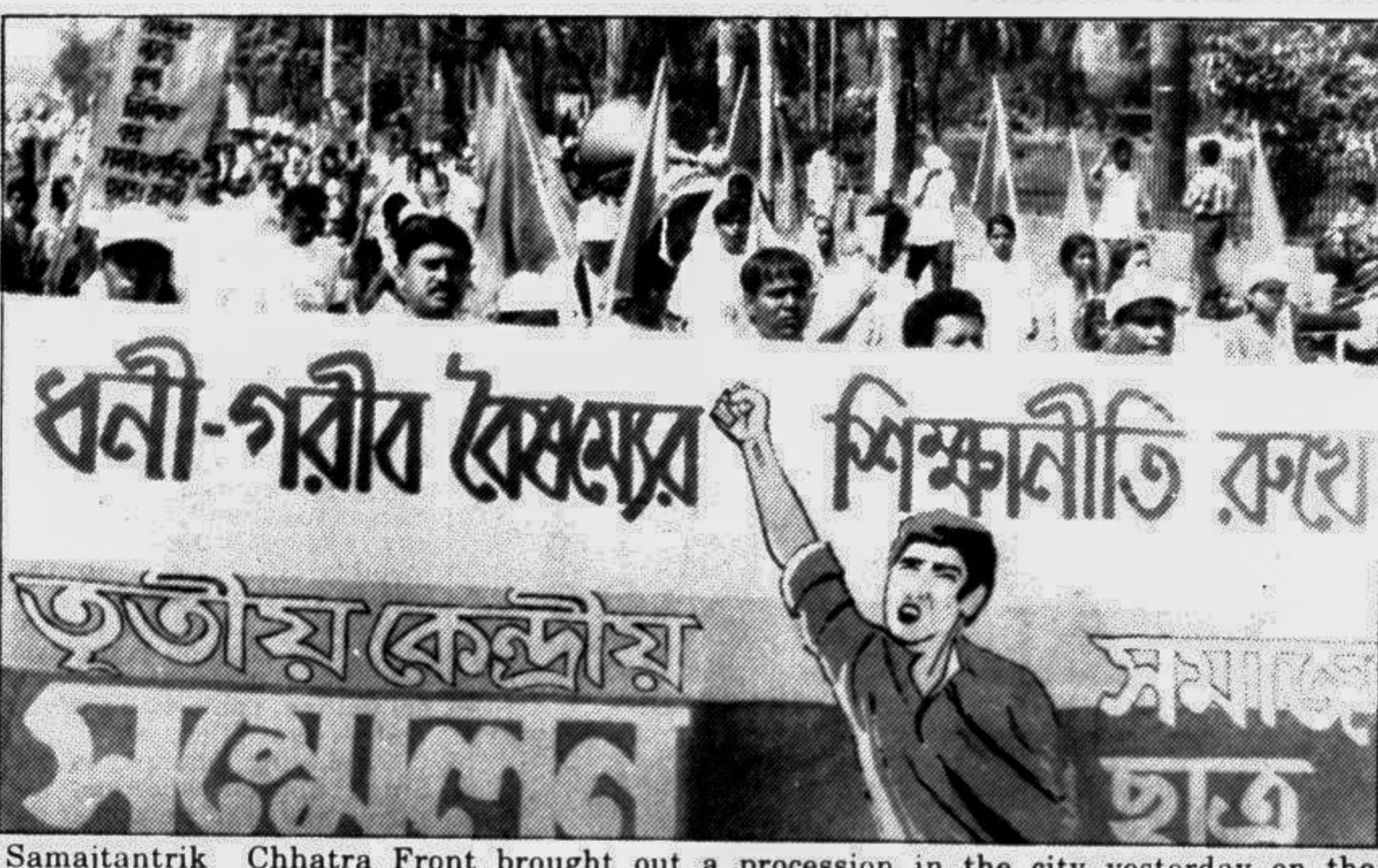
Samajtantrik Chhatra Front brought out a procession in the city yesterday on the occasion of its third conference.

CHEHLUM AND PRAY FOR HIS DEPARTED SOUL. MEMBERS OF THE BEREAVED FAMILY