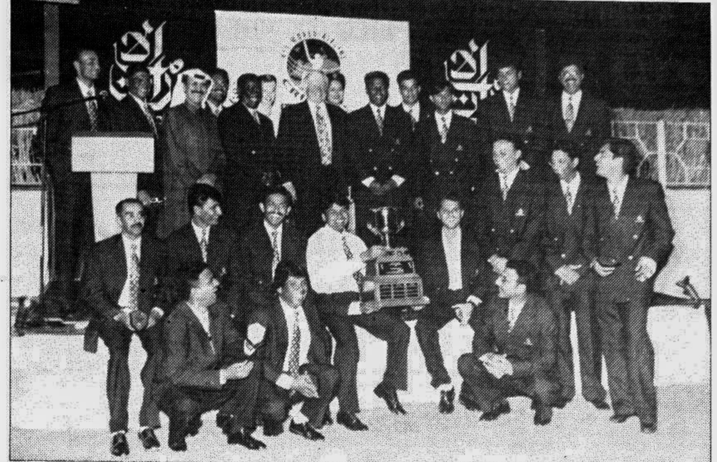
The Emirates team members, who won the world airline cricket tournament, pose with the trophy in Dubai recently.