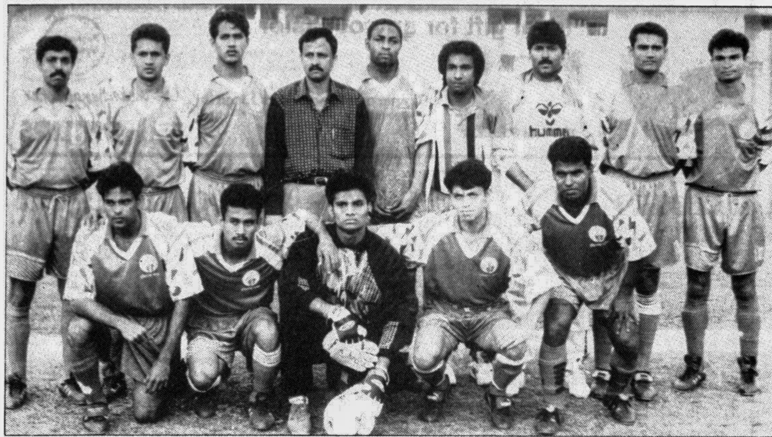
The players and officials of the victorious Muktiyoddha Sangsad Krira Chakra who clinched the coveted Premier Division football league title defeating holders Mohammedan Sporting Club at the Mirpur Stadium yesterday.