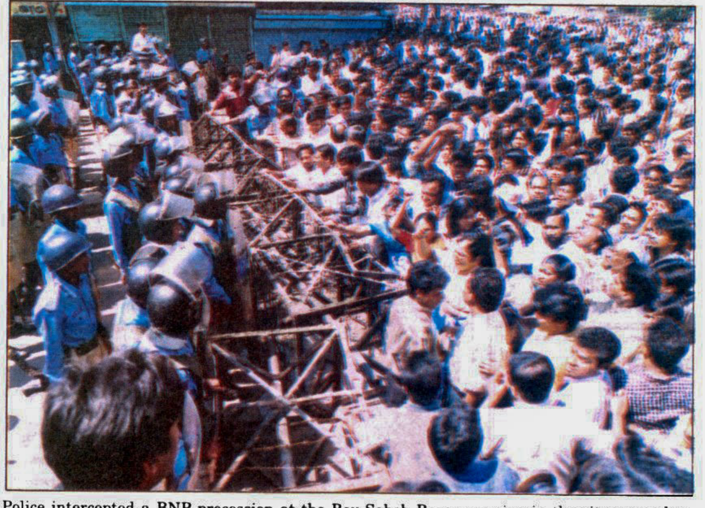
Police intercepted a BNP procession at the Roy Saheb Bazar crossing in the city yesterday. The procession was heading towards the DC office to gherao it.

By Staff Correspondent The Jatiya Sangsad yesterday adopted a resolution by voice vote condemning the sacrilege of the Shaheed Minar by BNP leaders and activists on February 21 and demanding punishment of those responsible for the incident. The resolution was passed during a brief walkout by the BNP. The BNP lawmakers also condemned the incident and demanded a parliamentary probe into the incident and staged a walkout in protest against the part of the Awami League resolution that censured the Opposition for the desecration. Earlier, some 15 MPs of Awami League, Bangladesh Nationalist Party and Jatiya Party took part in a general discussion on the issue that lasted for two and a half hours. The resolution, moved by Sheikh Fazlul Karim Selim of Awami League said that the leaders and activists of BNP and its front organisations desecrated the Language Movement memorial on February 21. Observing that the attack on the Shaheed Minar amounted to an attack on the national entity. Selim urged the House to take a resolution condemning the BNP and demanding punishment of those responsible for the incident. Deputy Leader of the Opposition in the House and BNP leader Prof Badruddoza Chowdhury refused to accept the allegation that BNP activists were involved in the desecration. He suggested that a parliamentary committee comprising MPs from both the Treasury and Opposition benches be constituted to probe the incident and that the names of activists of BNP and its front