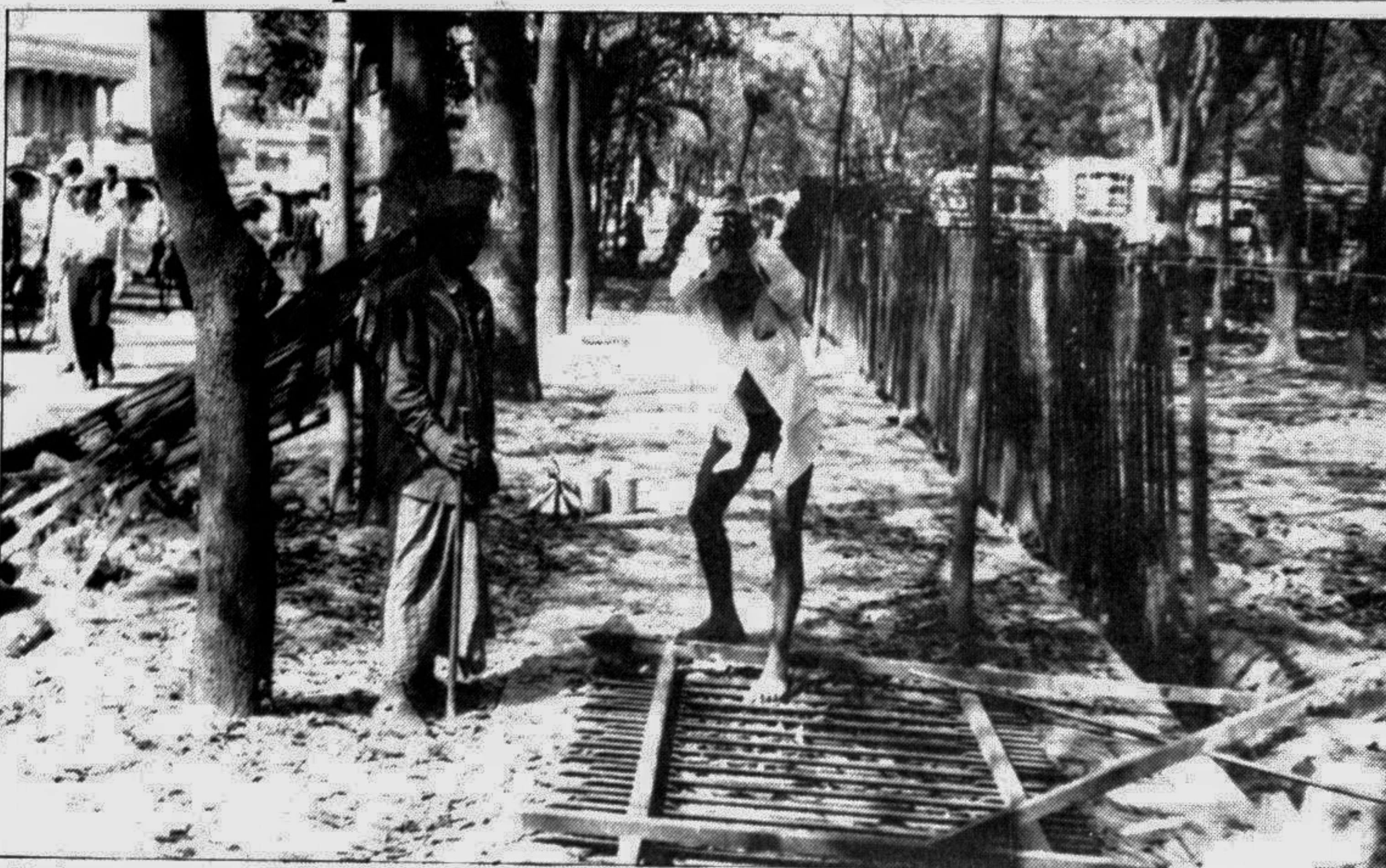
Workers removing iron railings from the south side of Osmani Uddayan for expansion of the road in front of Nagar Bhaban.