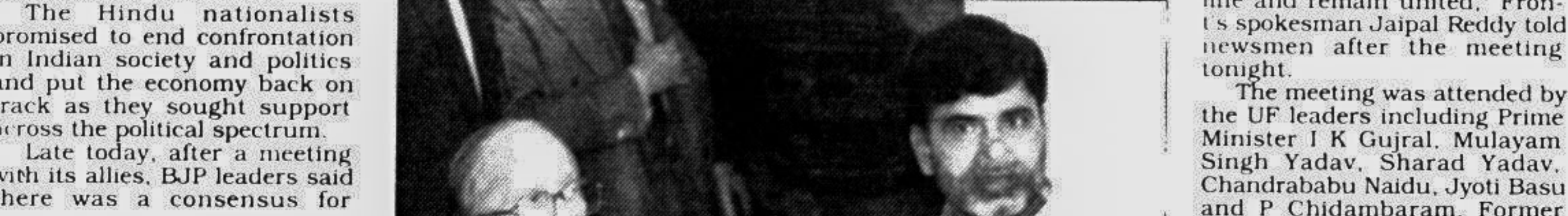
Chandrababu Naidu, leader of the Telegu Desam Party, attends a United Front meeting along with Jyoti Basu, leader of Communist Party of India (Marxist) in New Delhi yesterday.