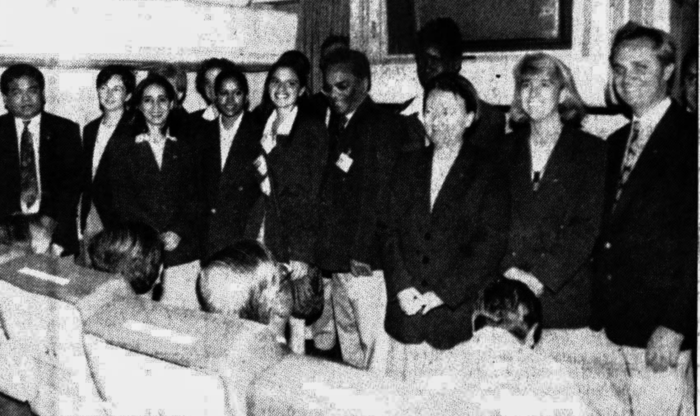
Doctors and staff of Orbis held a press briefing aboard their DC-10 aircraft at Zia International Airport yesterday.

Orbis, a fully operational eye hospital on board a DC-10 aircraft, has completed a three-week ophthalmic skill exchange programme yesterday.