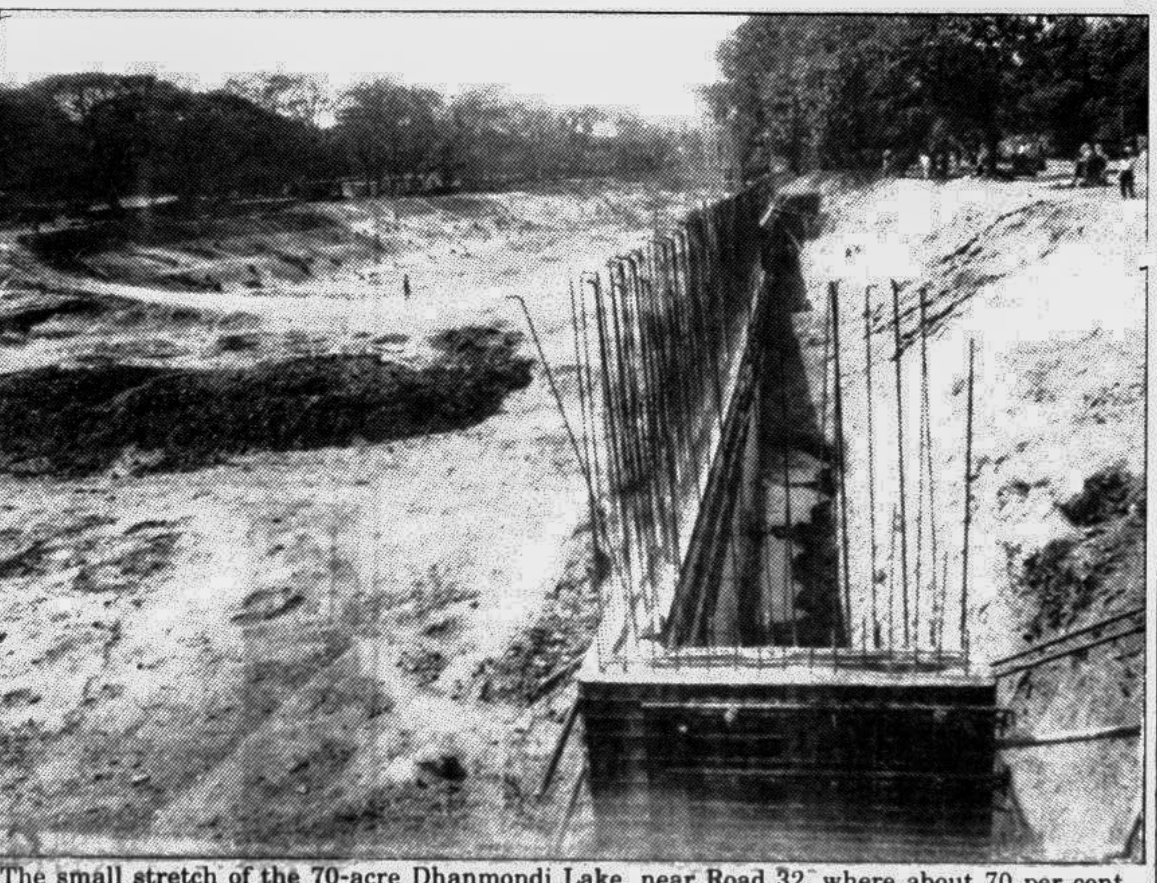
The small stretch of the 70-acre Dhanmondi Lake, near Road 32, where about 70 per cent of its development work has been completed.