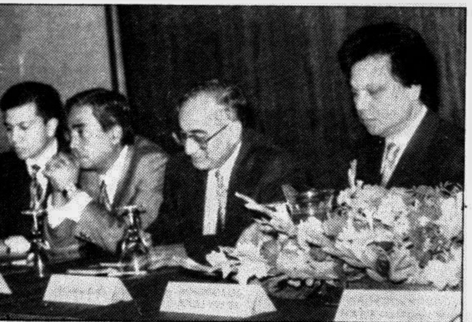
Construction firm Concord organised a seminar at a city hotel yesterday.

Construction, reconstruction and maintenance work of 3288 metres of bridges, and culverts have been completed, he added.